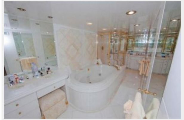
His and Her Master Bath