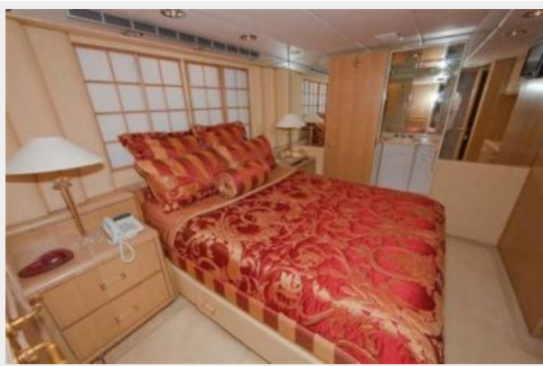
Port Queen Stateroom