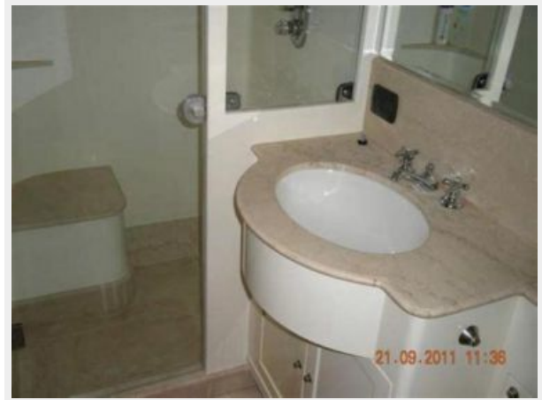
Guest Stateroom En-Suite Stall Shower