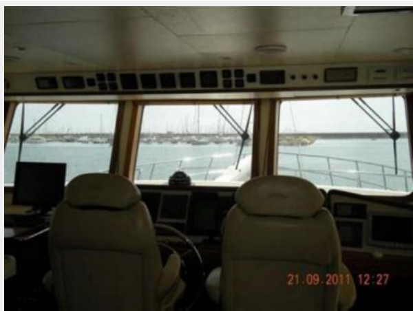
Pilothouse Looking Forward