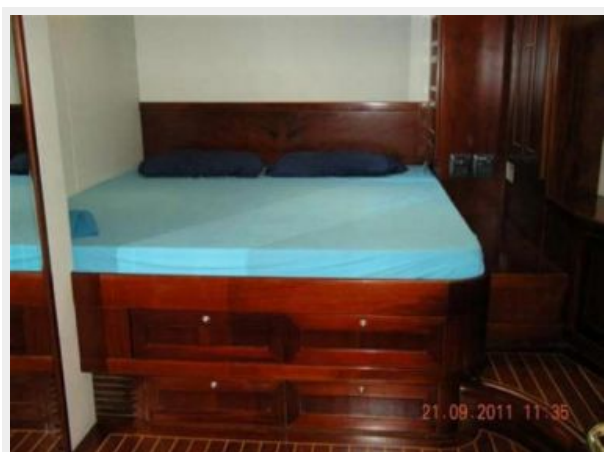
(2) VIP Staterooms Forward