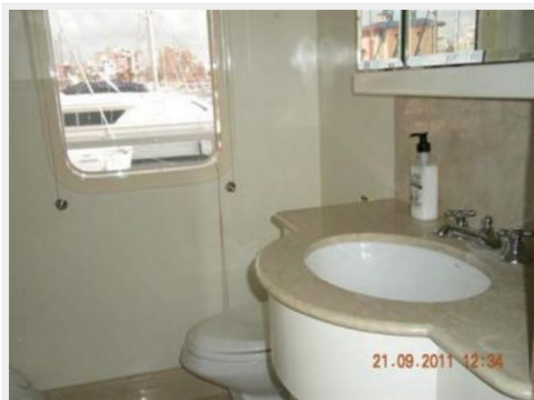
Master Stateroom En-Suite Head