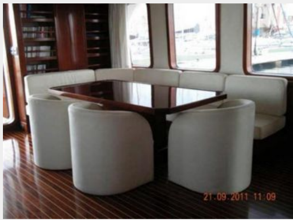
Salon Port Side Dining Table Looking Aft