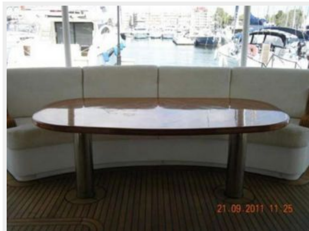
Salon Starboard Couch