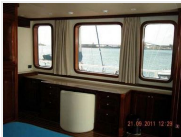
Master Stateroom Vanity