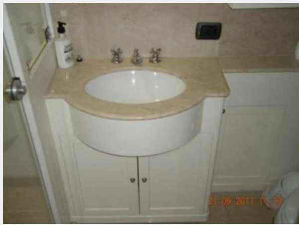
Guest Stateroom En-Suite Heads