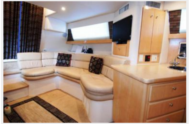
L-Shaped Salon Sofa