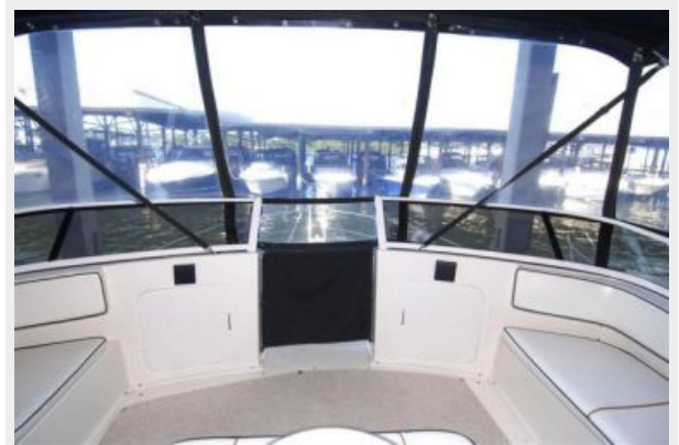
Closed Bow Walkthrough