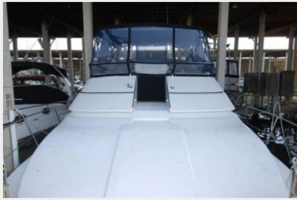
Closed Bow Walkthrough