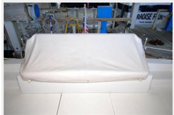
Cockpit Lounge with Cover