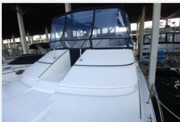
Flybridge from Bow