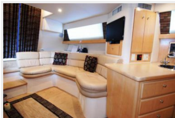
L-Shaped Salon Sofa