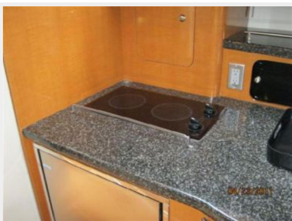
Galley - 2 Burner Stove