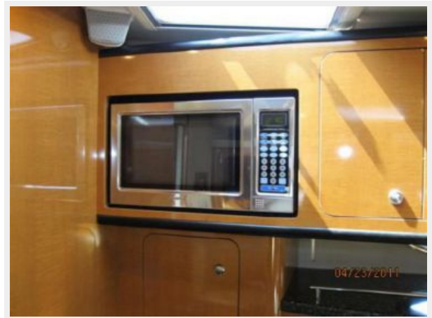
Galley - Microwave