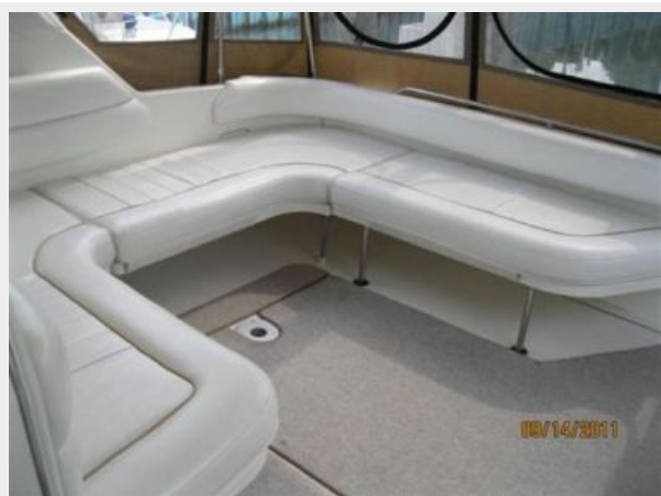
U-Shaped Cockpit Seating