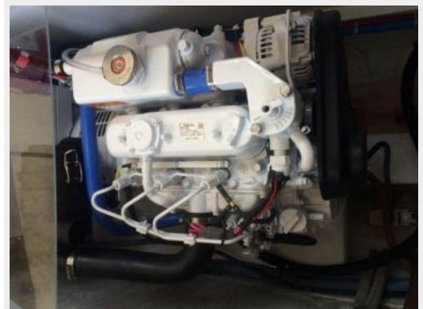
Phasor 9.5 Generator NEW