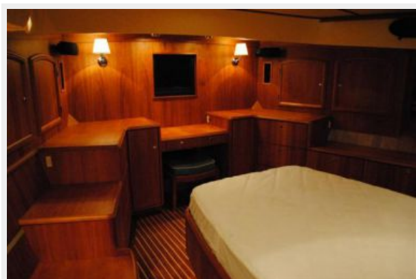
Master Stateroom 2