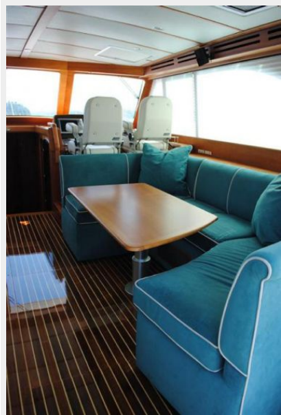
Salon Starboard Side Forward