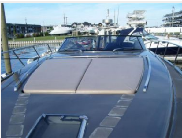
Fore Deck Sun Pad