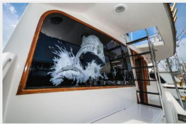
Custom Etched Glass Window