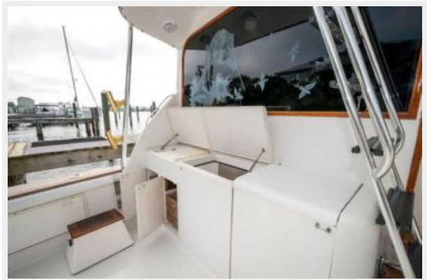
Cockpit Work Station