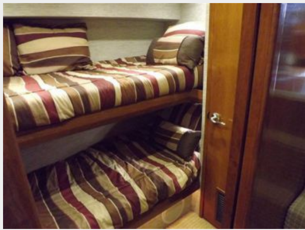
Guest Bunk Room