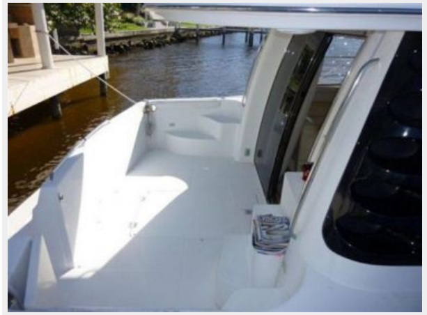
Carver 450 aft