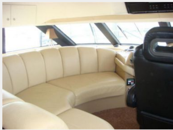
45' Carver lower helm seating