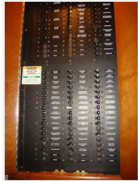
45' Carver electrical panel