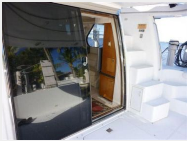
Carver 450 entry