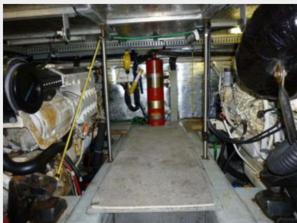
Carver 450 engine room