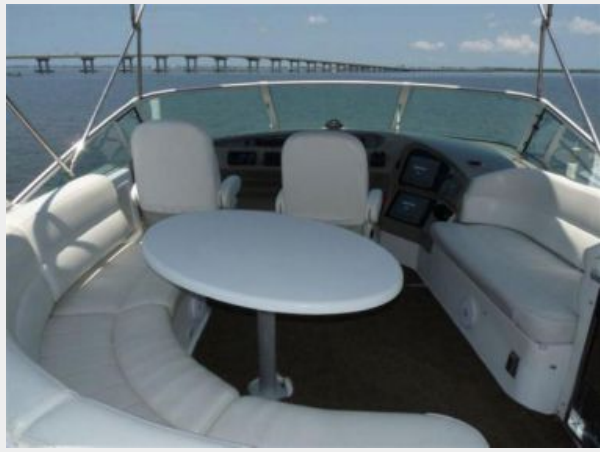
Carver 450 setee