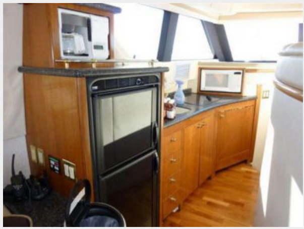
Carver 450 galley