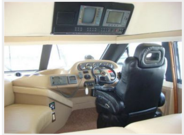
45' Carver lower helm1