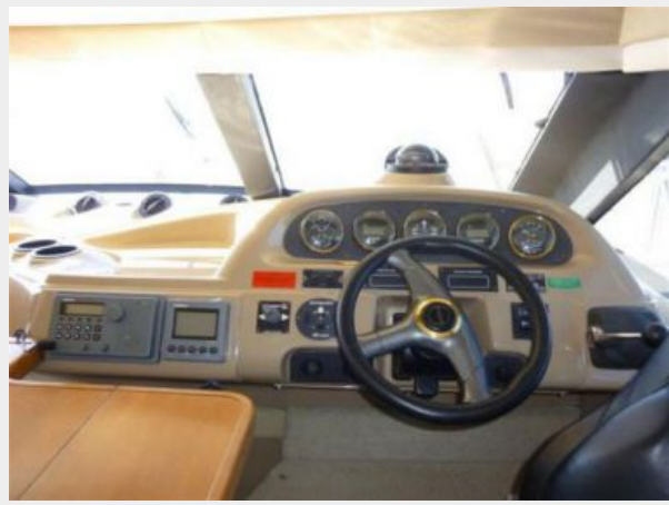
Carver 450 cockpit