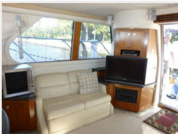
Carver 450 Flatscreen