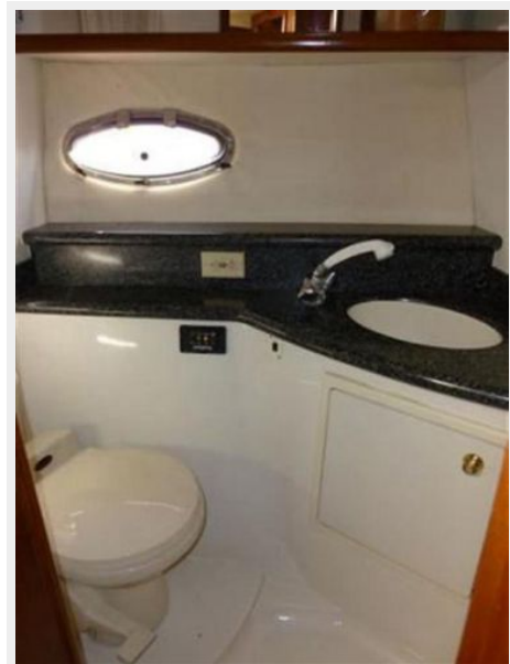
Carver 450 heads