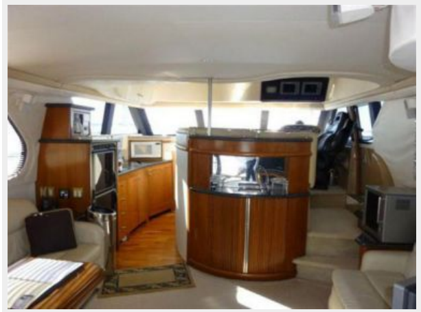
Carver 450 Salon