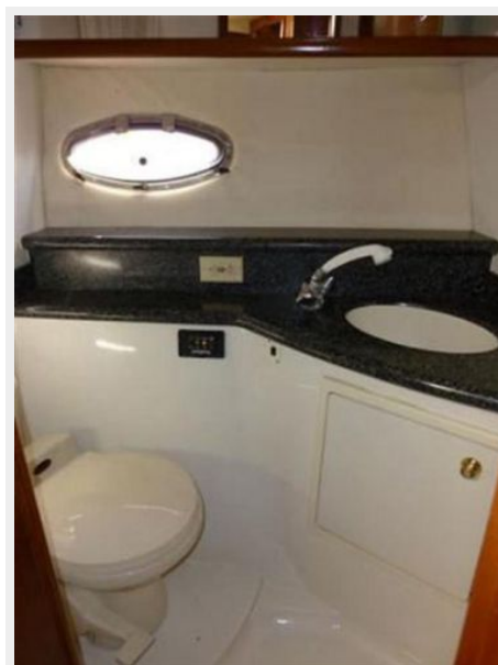
Carver 450 heads