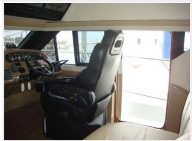
45' Carver lower helm2