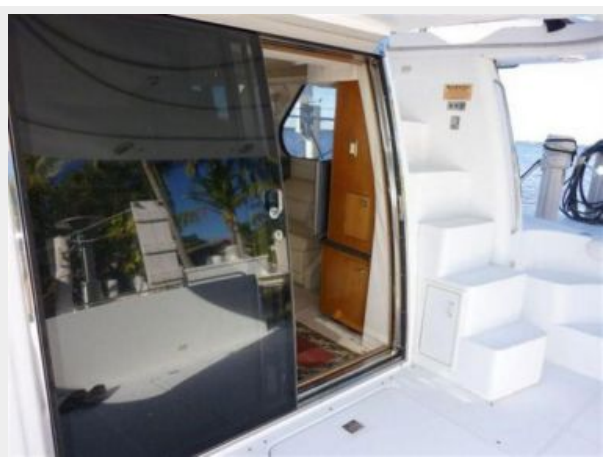
Carver 450 entry