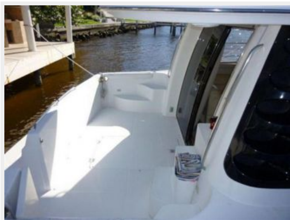
Carver 450 aft