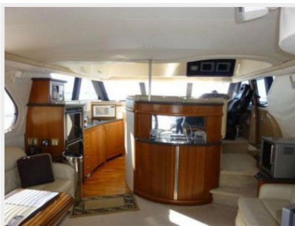
Carver 450 Salon