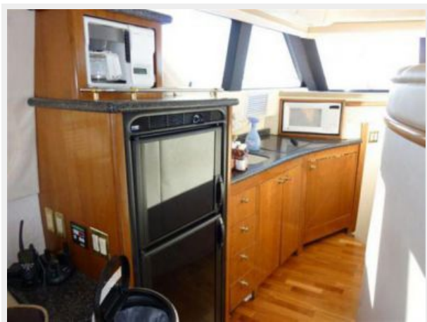
Carver 450 galley