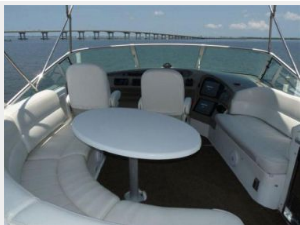
Carver 450 setee