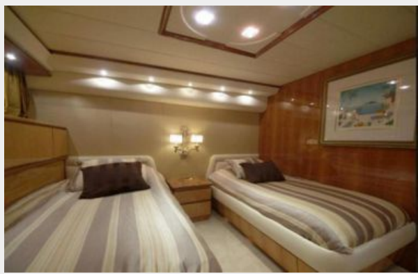
Twin Guest Stateroom