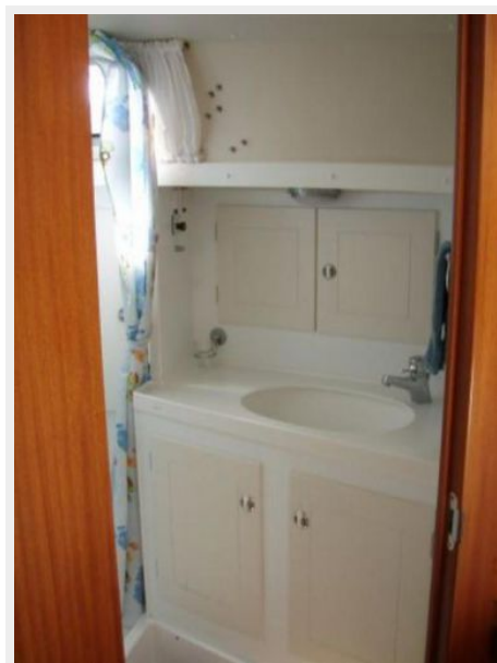
Head and Shower