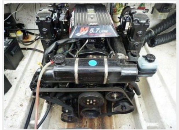
Engine and Mechanical Equipment 1