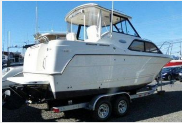
Profile 5 - Starboard Stern