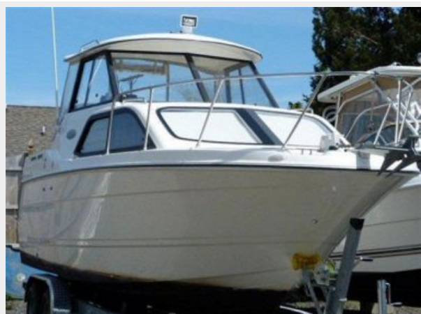
Profile 3 - Starboard Bow