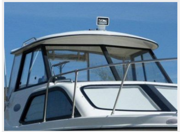
Deck 1 - Bridge