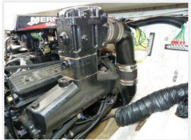
Engine and Mechanical Equipment 3 - Riser