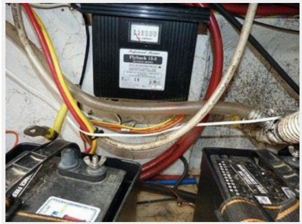
Electrical System 2