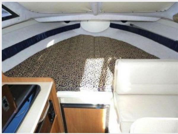
Main Cabin 1 - V-berth