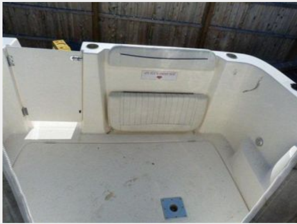
Deck 4 - Cockpit