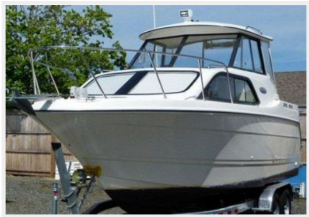
Profile 2 - Port Bow