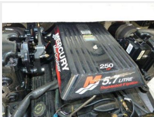
Engine and Mechanical Equipment 2 - Mercruiser