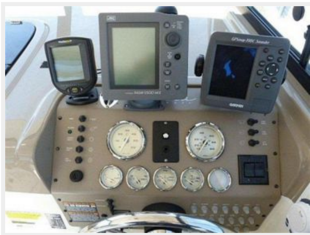
Helm 2 - Electronics & Navigation