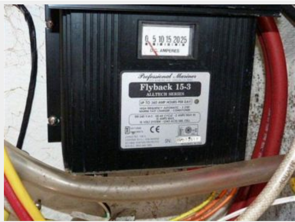
Electrical System 3