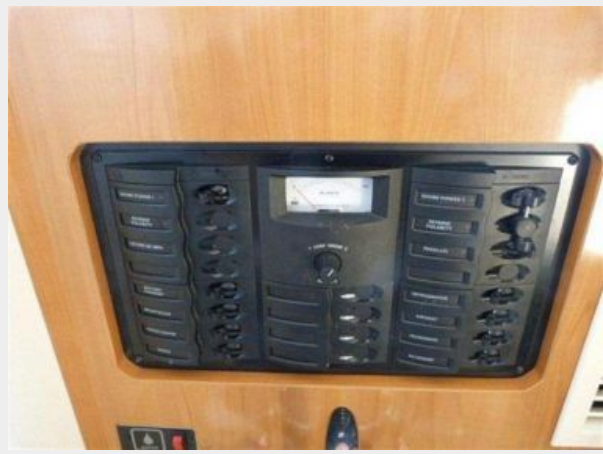
Electrical System 1 - Electrical Panel