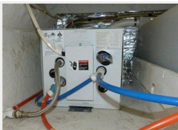
Engine and Mechanical Equipment 4 - Water Heater