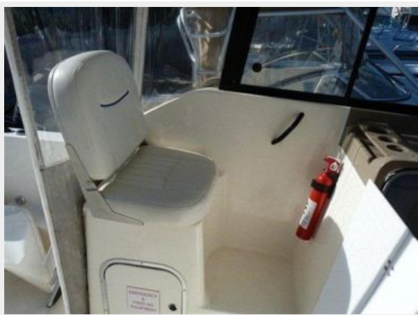
Deck 2 - Companion Seat