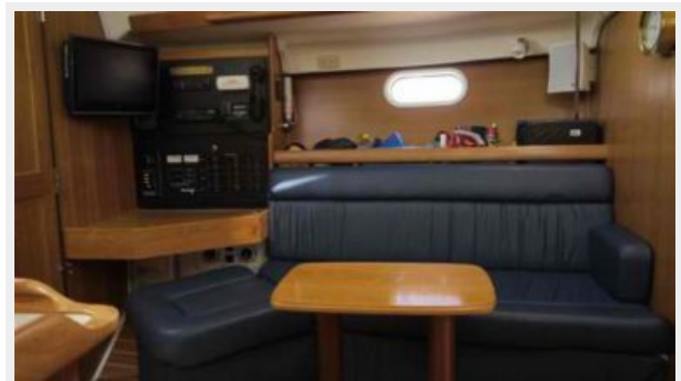
Salon - Dinette - Port Side