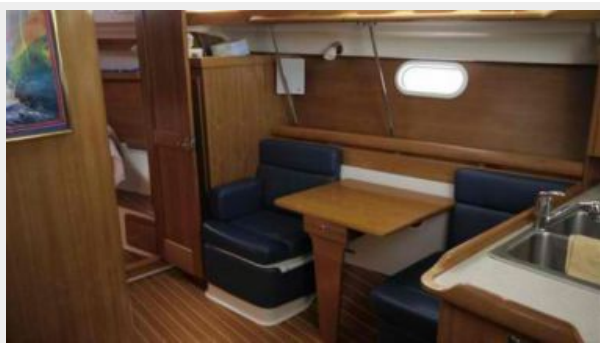
Salon - Starbd side