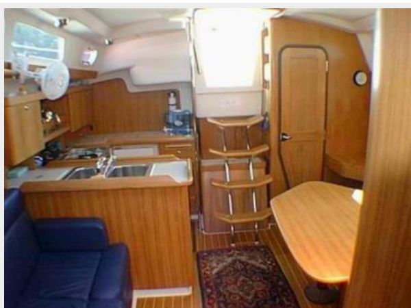
Salon - Aft View (sistership)