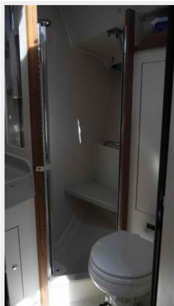
Head & Shower