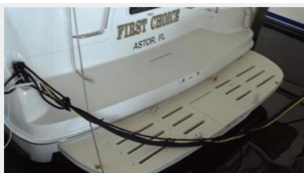
Extended Swim Platform