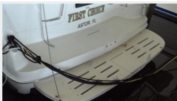
Extended Swim Platform