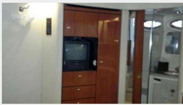
VIP SR TV