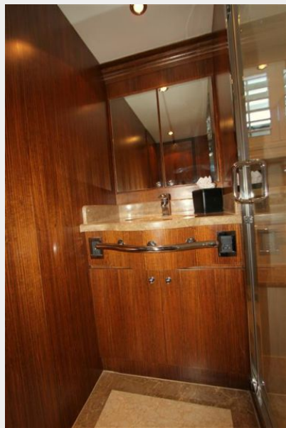
Guest Bath and Day Head