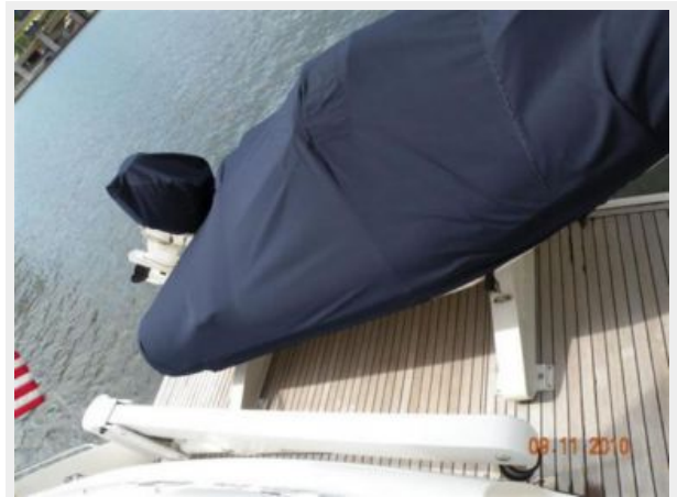
Crane for tender