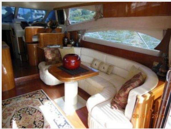
Salon Starboard Sofa