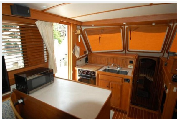
Galley - Port