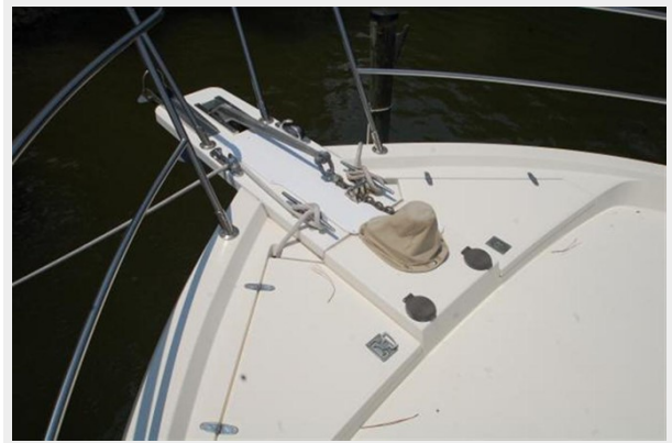
Bow / Anchoring System