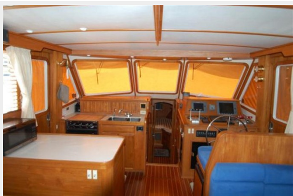
Helm & Galley - Port & starboard doors to side decks.