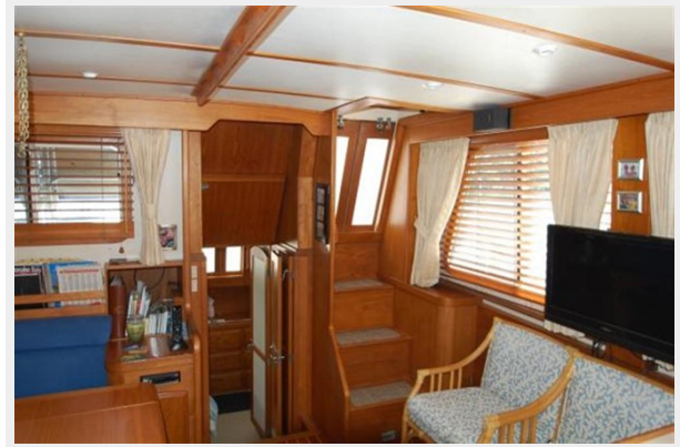
Salon - Stairs leading to aft deck & down to aft cabin.