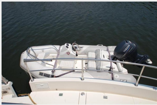
Dinghy on lift