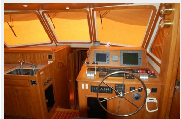
Helm - Starboard