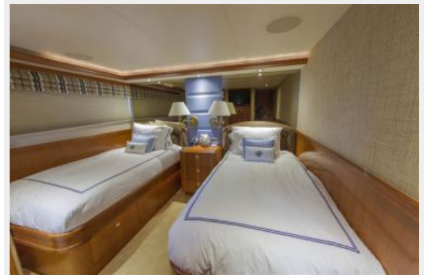
Guest Stateroom Starboard