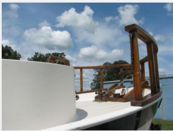
Forwad Ddeck Railing