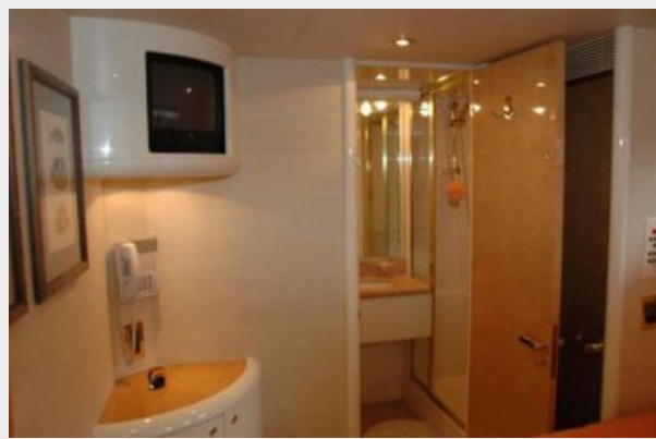
Starboard Aft Guest Stateroom