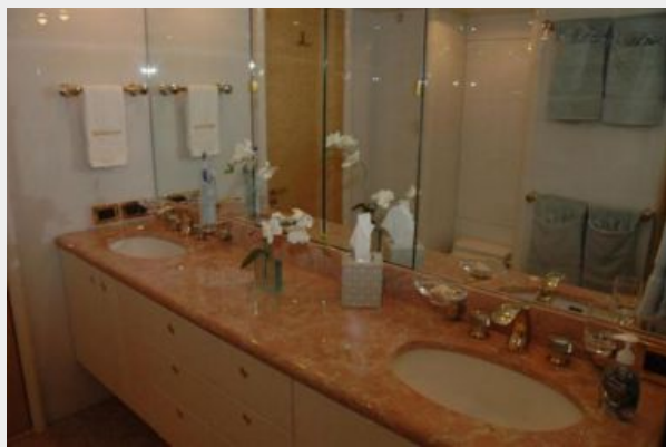
Master Head Sinks