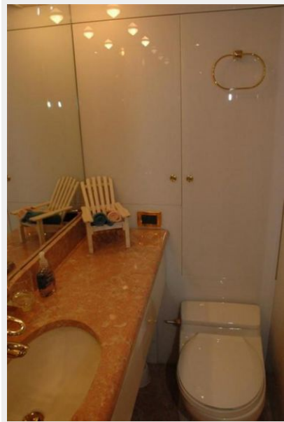
Port Guest Stateroom Head