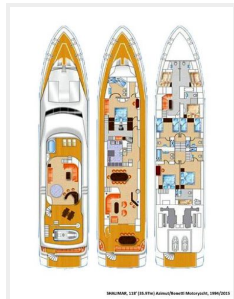
SHALIMAR, 118' (35.97m) Azimut/Benetti Motoryacht, 1994/2015