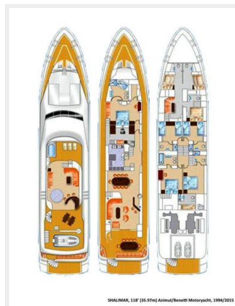
SHALIMAR, 118' (35.97m) Azimut/Benetti Motoryacht, 1994/2015