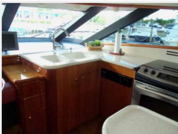
Galley Looking Forward