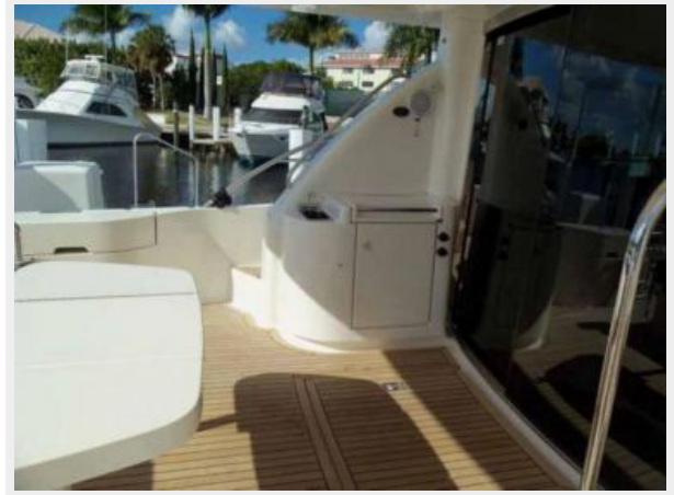
Aft Deck to Port