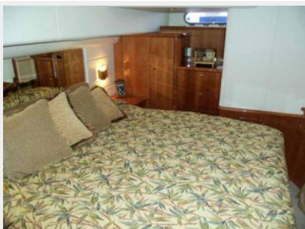
Master Looking to Port