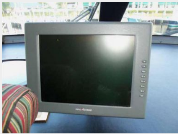
Salon Plotter Screen