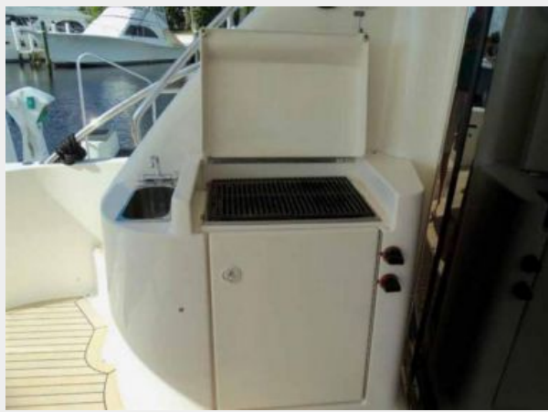
Aft Deck Grill