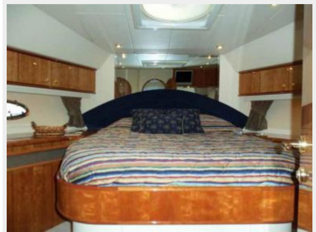
VIP Looking Forward