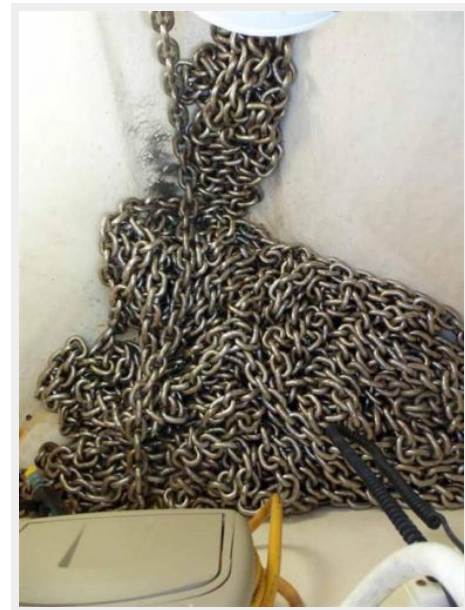
All S/S Anchor Chain