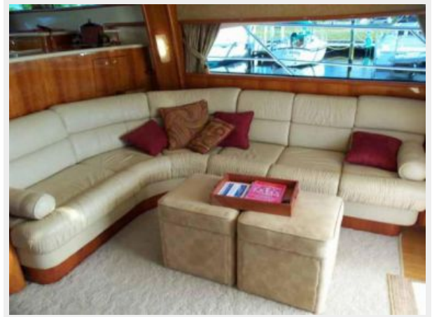
Salon Looking Starboard