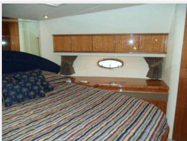
VIP Looking to Starboard