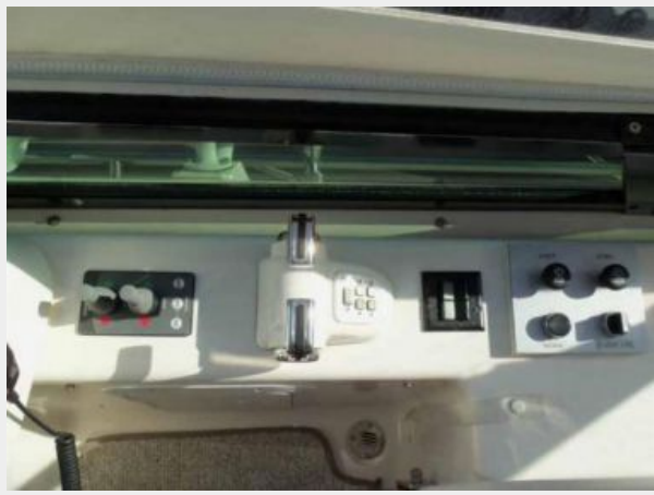
Flybridge Starboard Side Controls