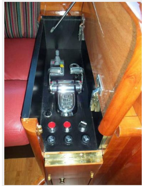
Hidden Lower Helm Equipment