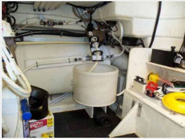
Lazarette Looking Starboard