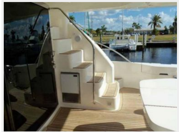
Aft Deck IceMaker