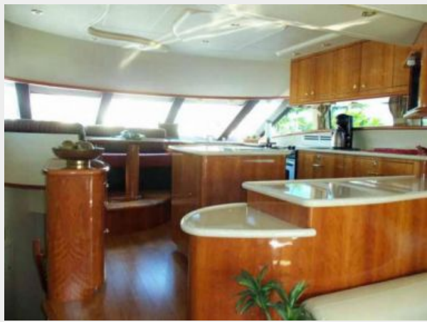
Galley Looking Forward