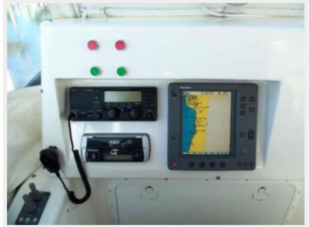
Flybridge Portside Nav Station