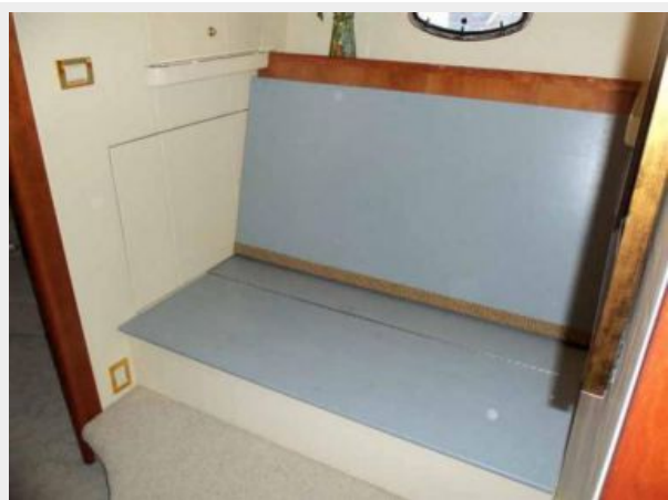
Settee Being Converted