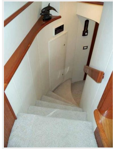
Companionway Looking Down