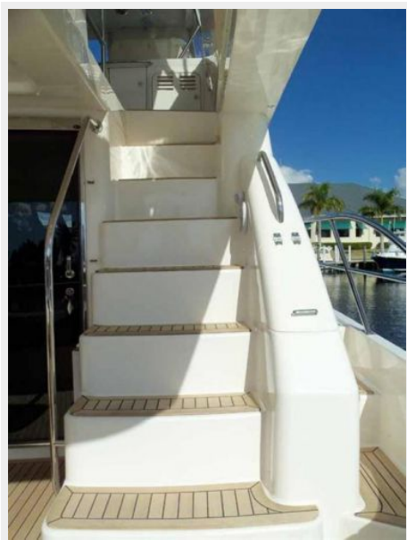
EZ Bridge Access Steps