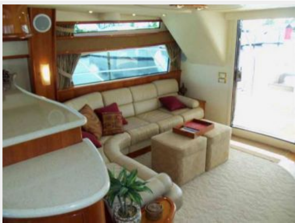
Salon Looking Aft to Starboard