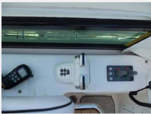
Flybridge Portside Controls