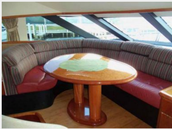
Galley Dining Settee