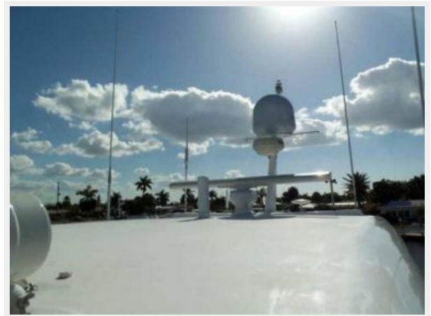
Coach Roof Equipment Aft