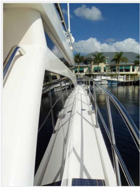
Spacious Side Decks