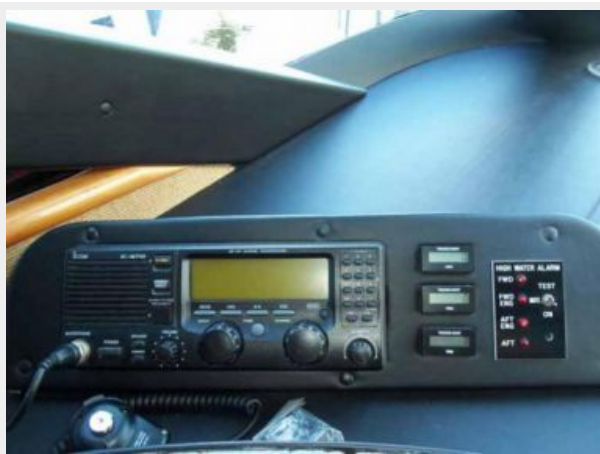
Salon SSB & Bilge Alarm