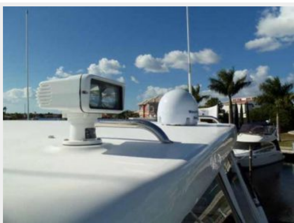
Coach Roof Equipment Forward