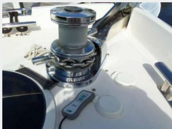
Oversized Windlass Detail