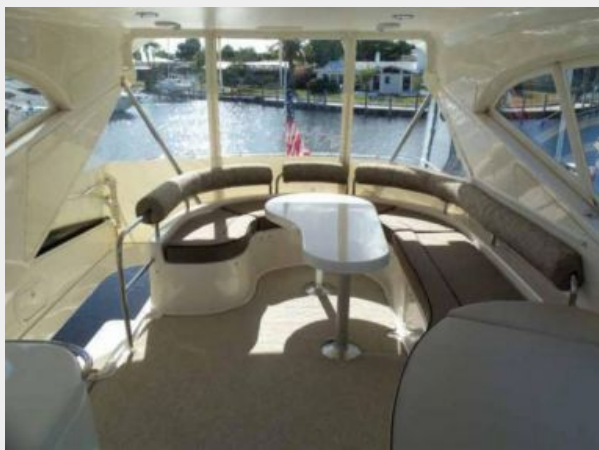
Flybridge Looking Aft