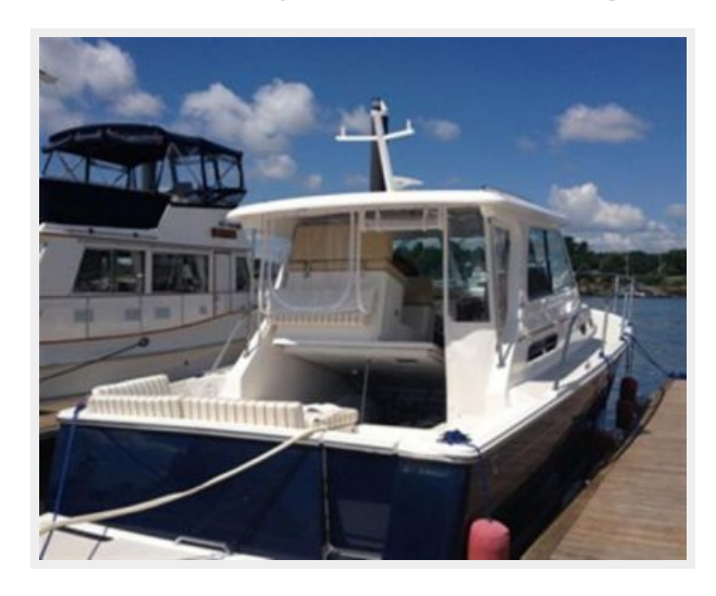
Hatch to Engine Room via cockpit