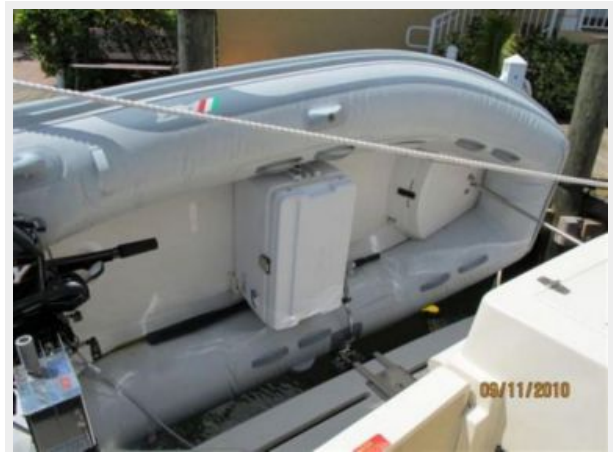
10' AB RIB