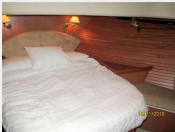
Master to Starboard