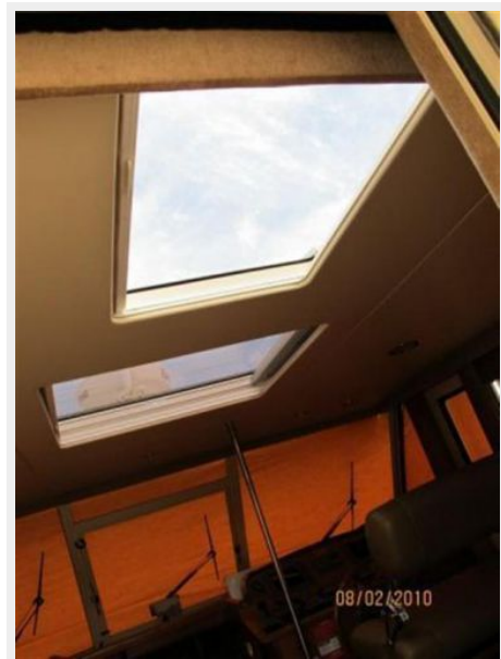
Rear Sky Light