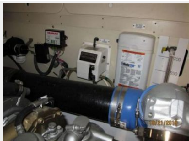
Oil Change System