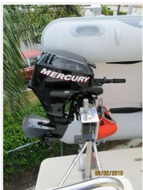
20 hp Mercury 4 Stroke