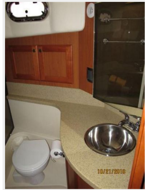
Head and Sink