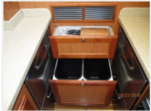
More Galley Storage