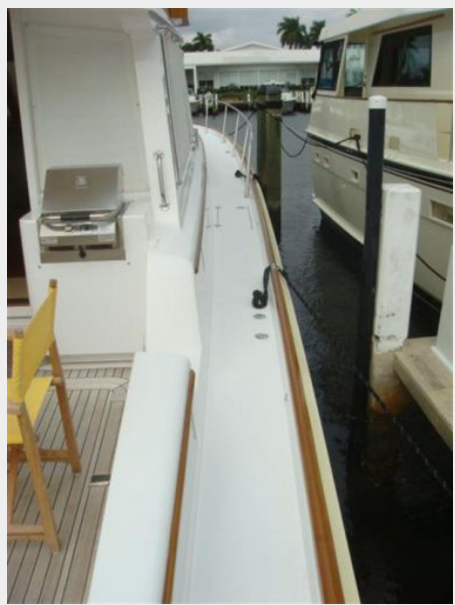
67' Lyman-Morse starboard side deck photo2