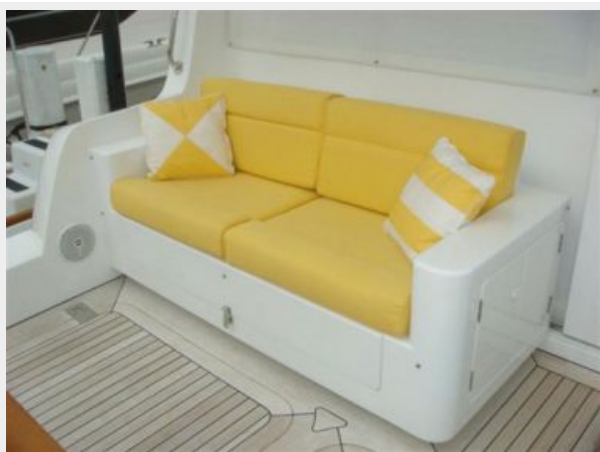
67' Lyman-Morse aftdeck seating