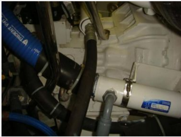
67' Lyman-Morse starboard gearbox