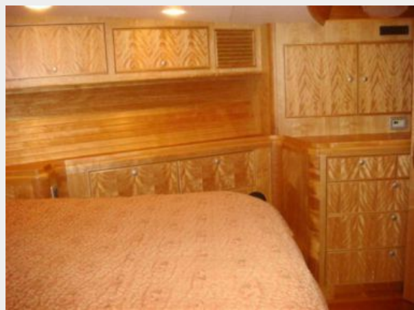
67' Lyman-Morse guest stateroom starboard