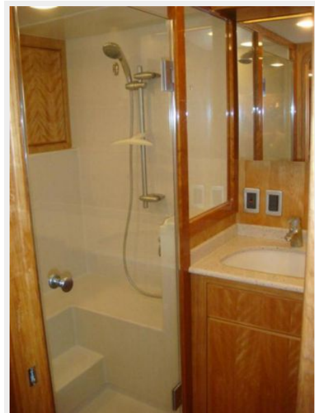
67' Lyman-Morse master stateroom shower