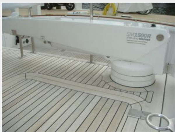
67' Lyman-Morse tender davit