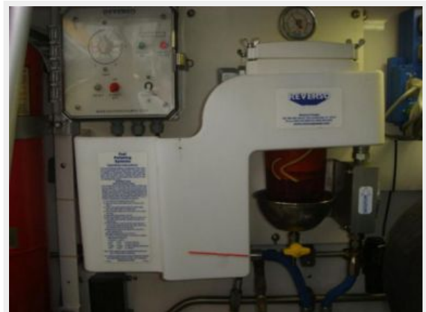
67' Lyman-Morse fuel polishing system