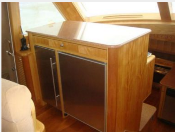
67' Lyman-Morse pilothouse port forward