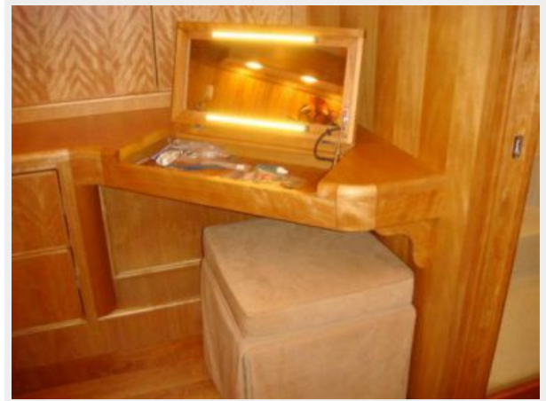
67' Lyman-Morse master stateroom vanity