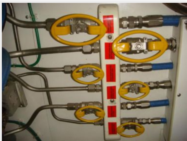
67' Lyman-Morse fuel manifold