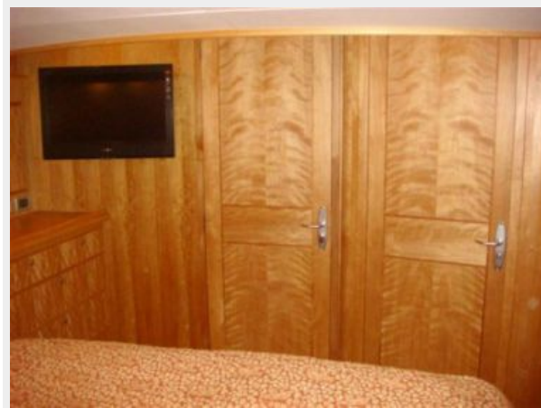
67' Lyman-Morse guest stateroom aft