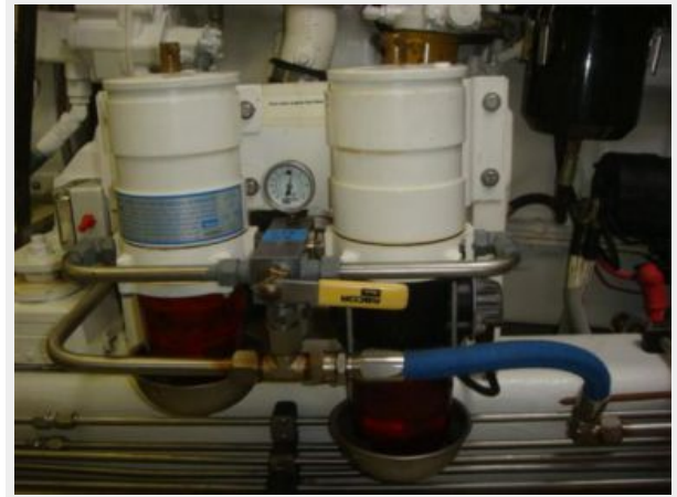
67' Lyman-Morse starboard Racor fuel filters