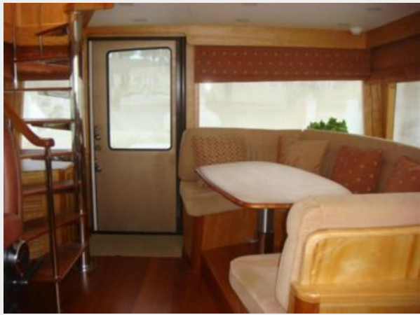
67' Lyman-Morse pilothouse aft