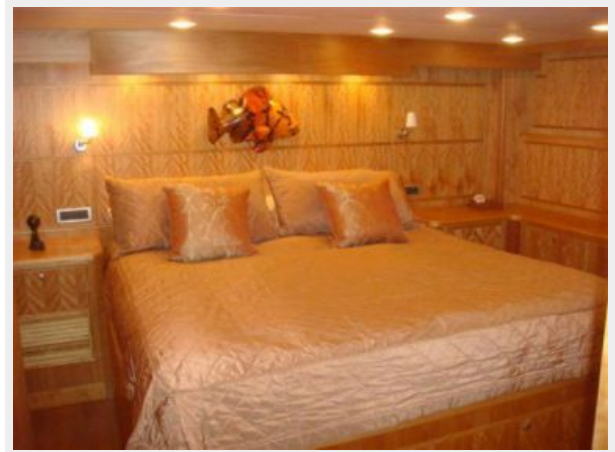
67' Lyman-Morse master stateroom