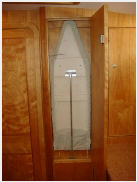
67' Lyman-Morse built-in ironing board