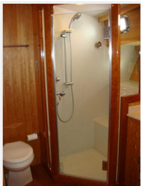
67' Lyman-Morse guest stateroom head