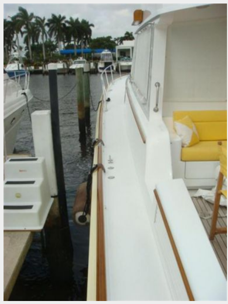
67' Lyman-Morse port side deck photo2