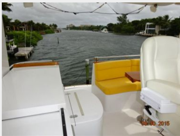
67' Lyman-Morse flybridge aft