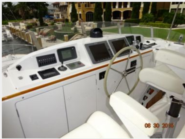
67' Lyman-Morse flybridge helm photo2