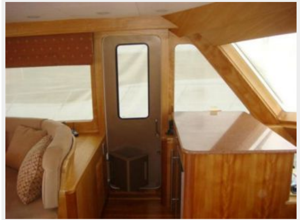
67' Lyman-Morse pilothouse port