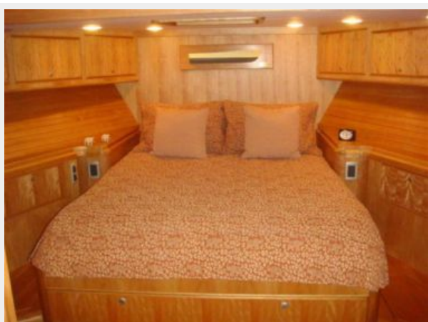
67' Lyman-Morse guest stateroom