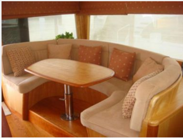
67' Lyman-Morse pilothouse seating