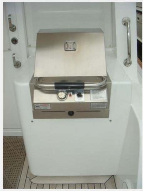
67' Lyman-Morse aftdeck BBQ grill