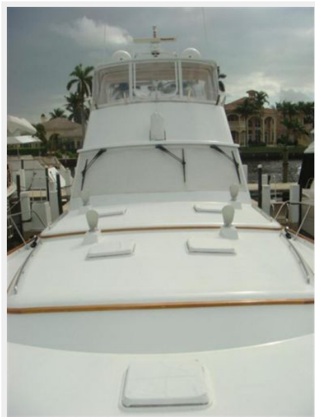
67' Lyman-Morse foredeck aft