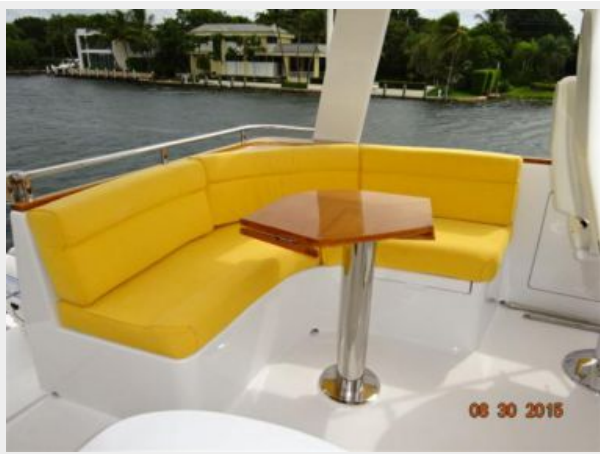
67' Lyman-Morse flybridge seating