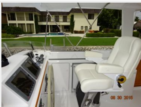
67' Lyman-Morse flybridge starboard