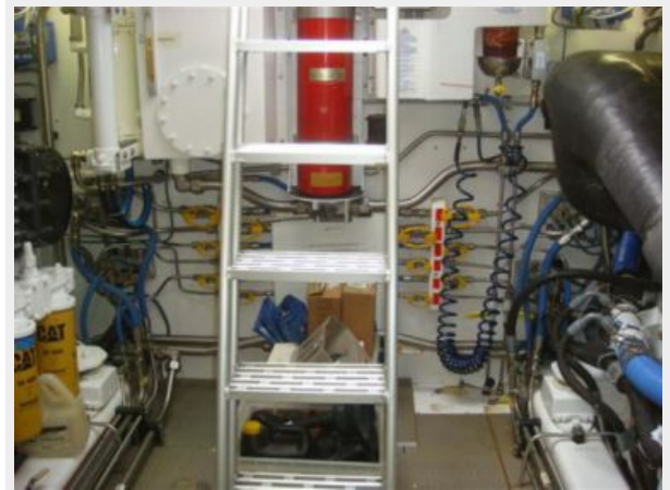
67' Lyman-Morse engine room