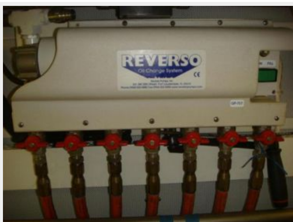
67' Lyman-Morse oil change system