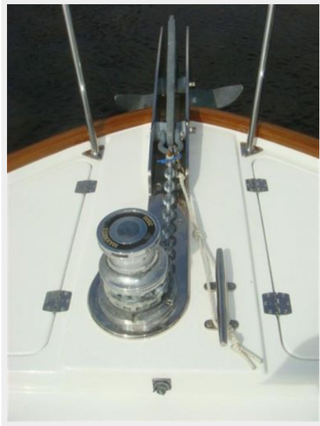
67' Lyman-Morse anchor windlass