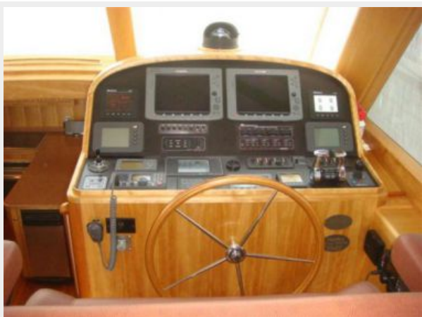
67' Lyman-Morse pilothouse helm