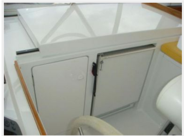
67' Lyman-Morse flybridge refrigerator