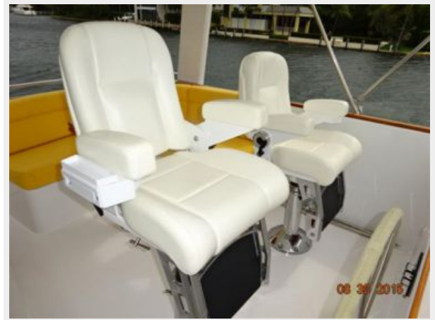
67' Lyman-Morse flybridge helmseats