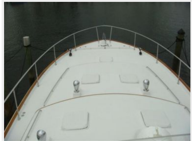
67' Lyman-Morse foredeck