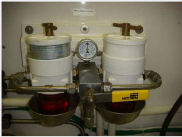
67' Lyman-Morse port generator Racor fuel filters