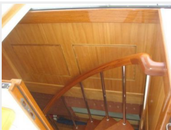
67' Lyman-Morse flybridge-pilothouse stairs