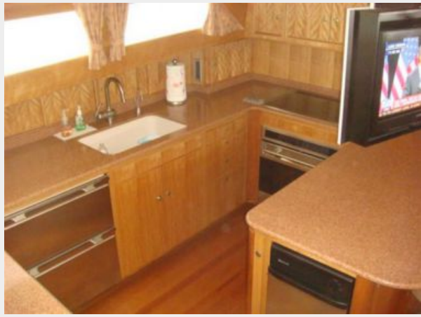
67' Lyman-Morse galley photo1