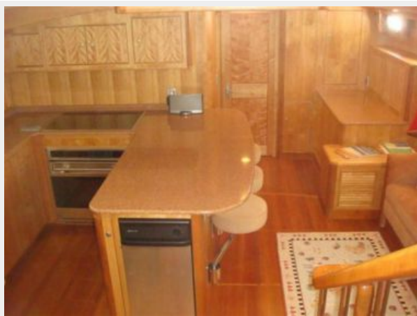
67' Lyman-Morse salon forward