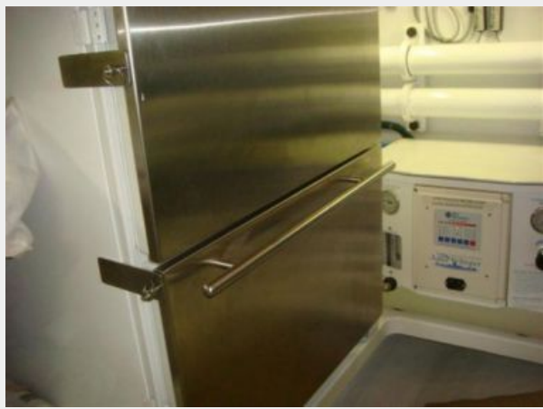
67' Lyman-Morse extra refrigeration