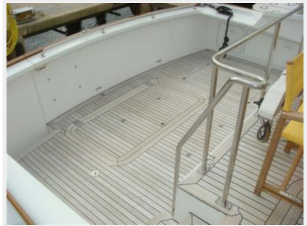
67' Lyman-Morse cockpit