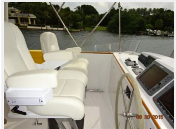
67' Lyman-Morse flybridge port