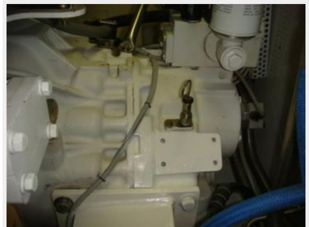
67' Lyman-Morse port gearbox