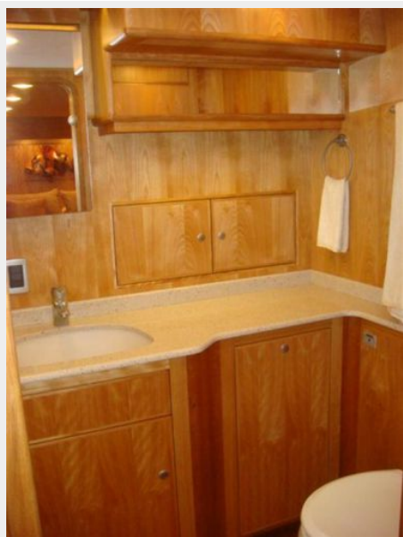
67' Lyman-Morse master stateroom head