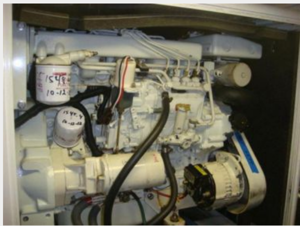
67' Lyman-Morse starboard generator