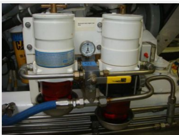
67' Lyman-Morse port Racor fuel filters