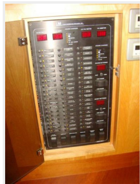
67' Lyman-Morse pilothouse electrical panel