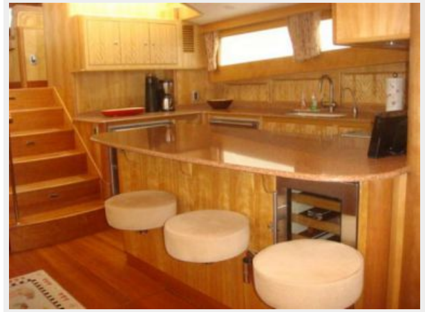
67' Lyman-Morse galley photo2