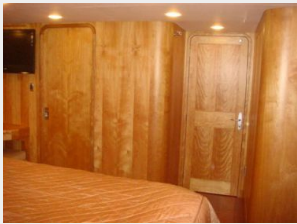
67' Lyman-Morse master stateroom forward