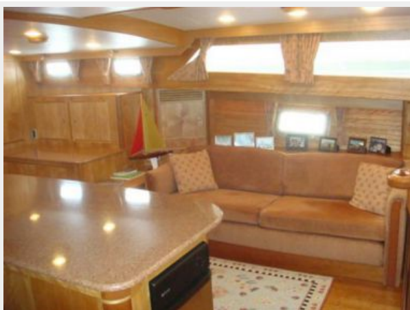
67' Lyman-Morse salon starboard