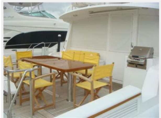
67' Lyman-Morse aftdeck