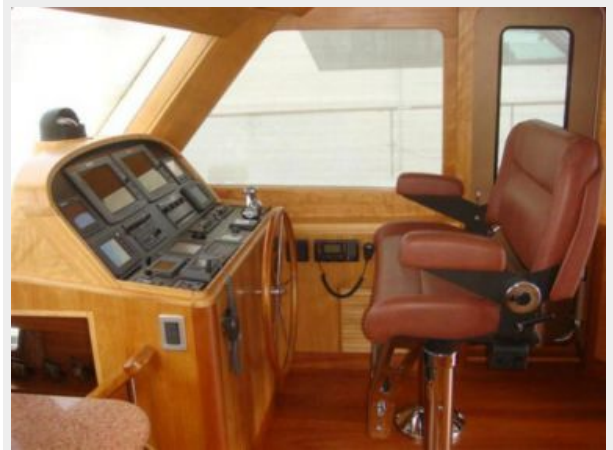
67' Lyman-Morse pilothouse starboard