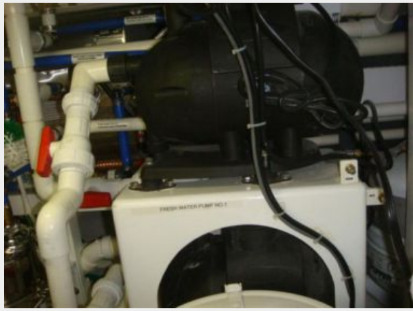
67' Lyman-Morse fresh water system pumps