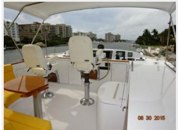
67' Lyman-Morse flybridge forward