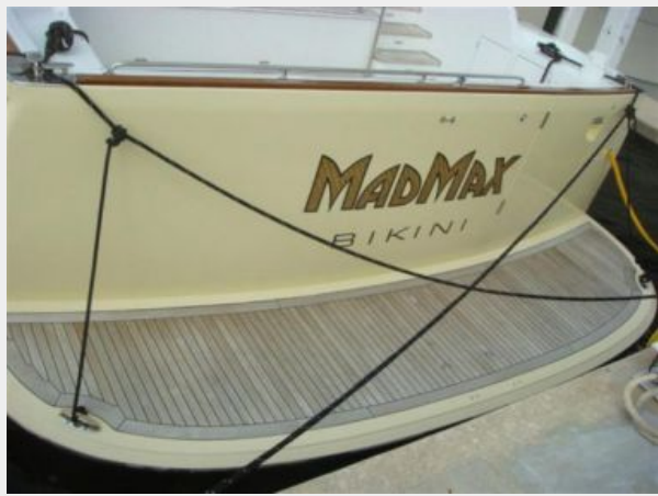
67' Lyman-Morse swimplatform