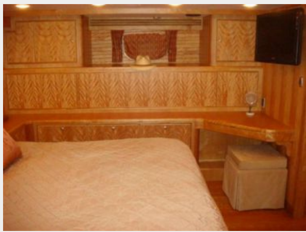
67' Lyman-Morse master stateroom port