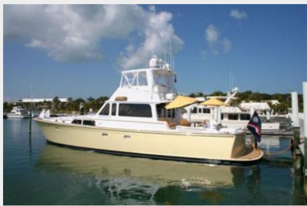
67' Lyman-Morse port profile