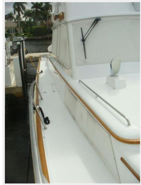
67' Lyman-Morse starboard side deck photo1