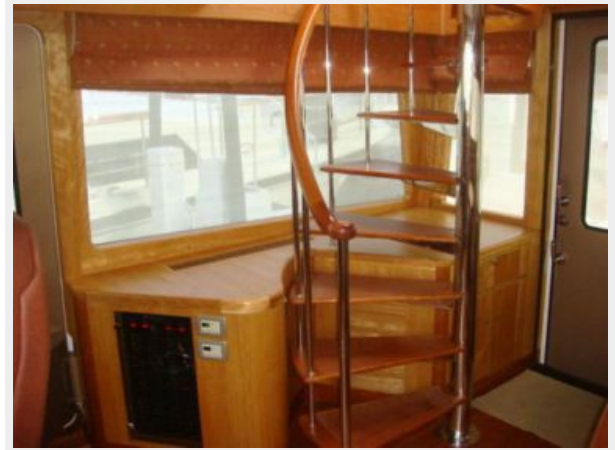
67' Lyman-Morse pilothouse starboard aft