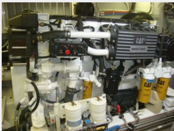
67' Lyman-Morse port main engine