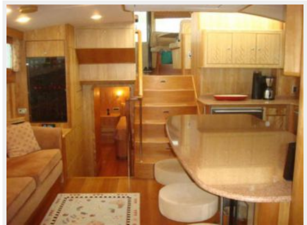
67' Lyman-Morse salon aft