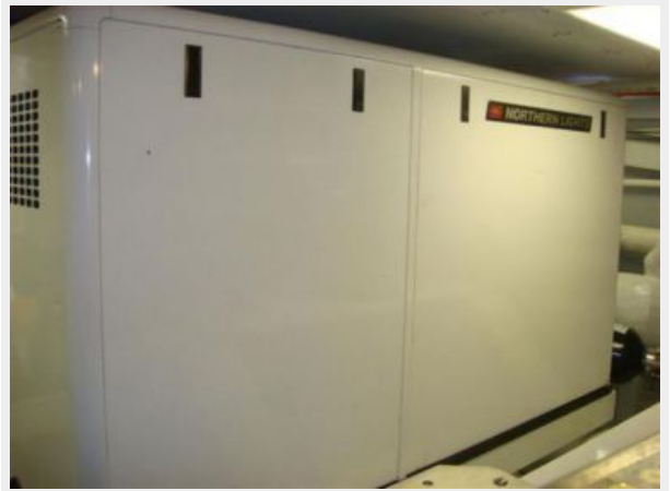
67' Lyman-Morse starboard generator sound box