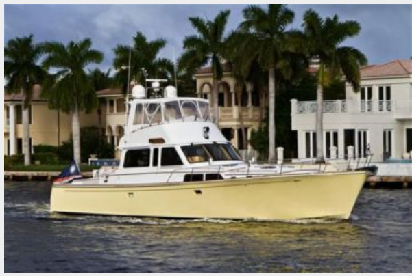
67' Lyman-Morse starboard profile