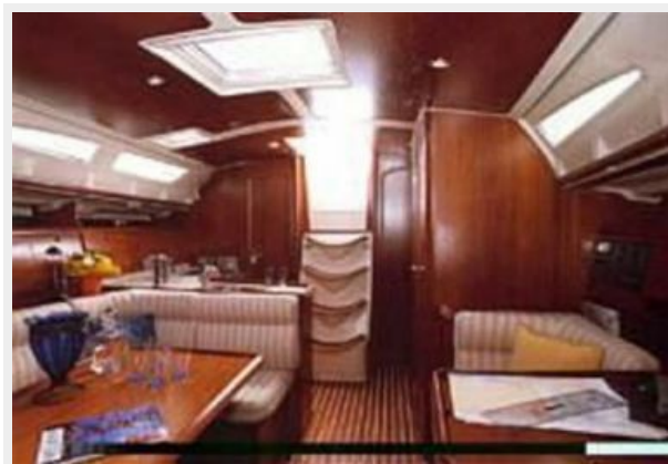
Salon - Factory Brochure Photo