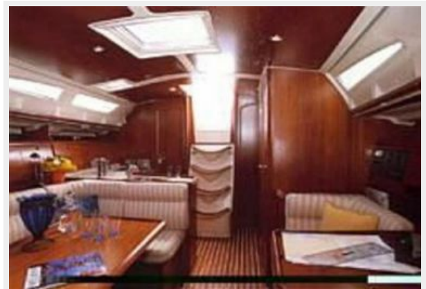
Salon - Factory Brochure Photo