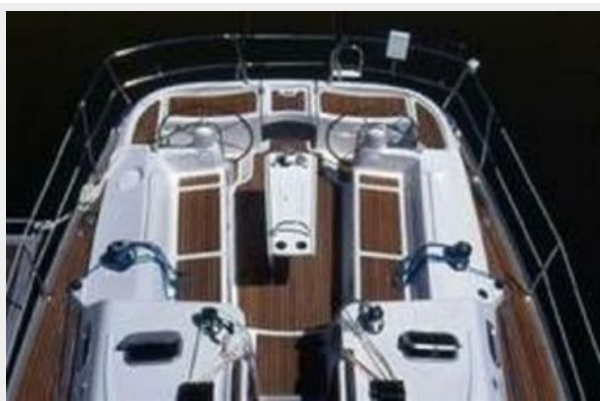
Cockpit - Factory Brochure Photo