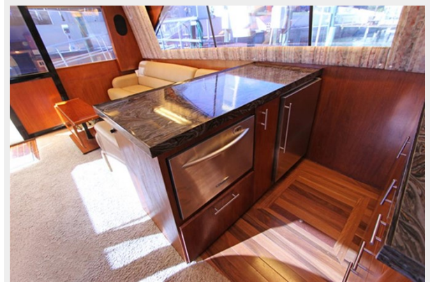
Island With Stainless Dishwasher & Fridge/Freezer Combo