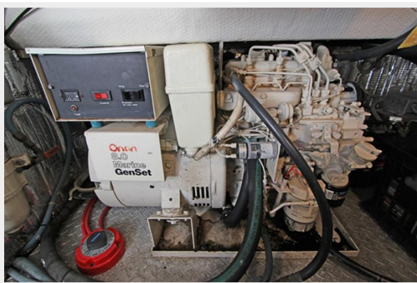
Onan 8KW Generator