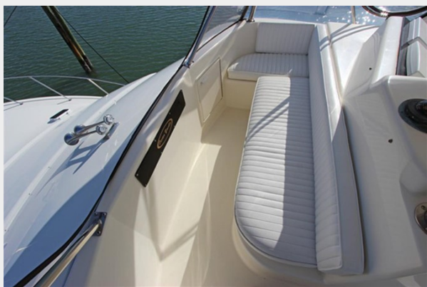
Forward Flybridge Seating