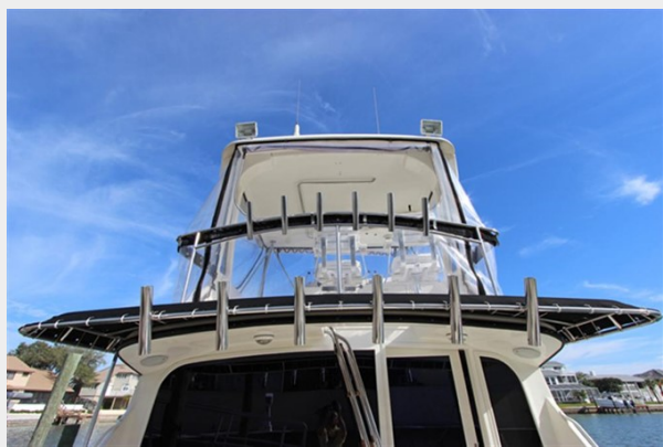
Lots of Rod Storage