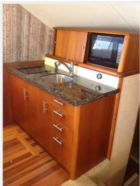
Stainless Steel Sink