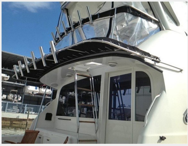
Canvas Cockpit Overhang & Rocket Launchers