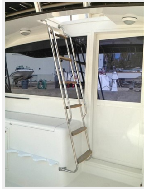
Stairway To Flybridge