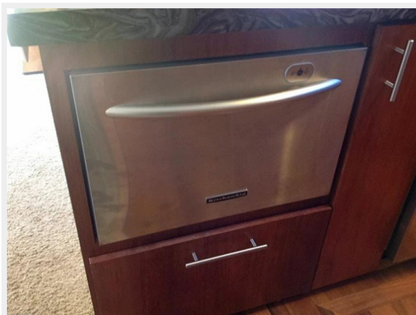
Kitchen Aid Stainless Dishwasher