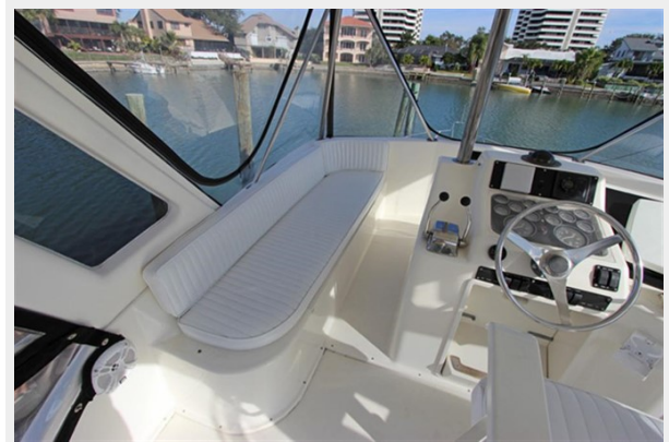
Port Flybridge Seating