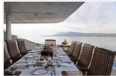
A&I Aft Deck Dining