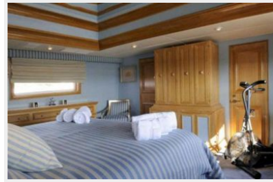
A&I Master Stateroom