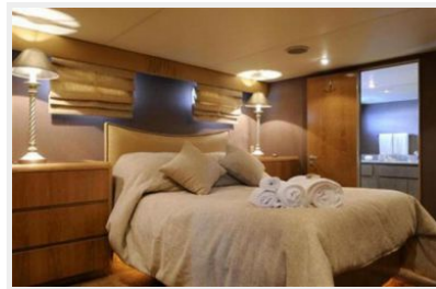
A&I Guest Stateroom