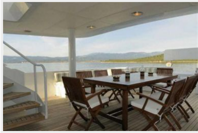
A&I Upper Aft Deck Dining