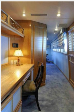
A&I Master Office