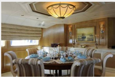
A&I Formal Dining