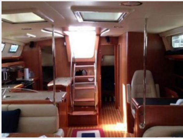
Main Salon looking aft