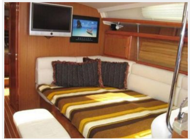
Main Salon Table made-up as sleeping double