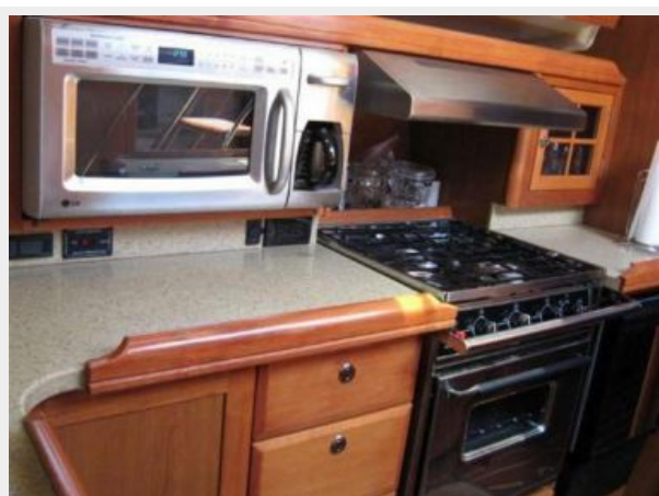
Galley Detail 1