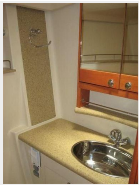
Master Cabin Head & Shower Detail