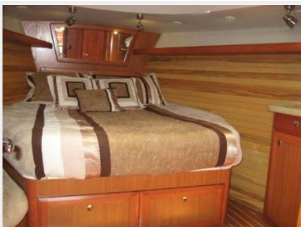
Master Cabin Forward