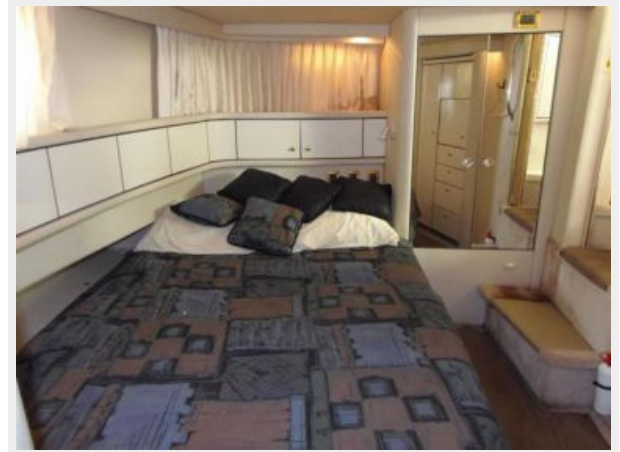
Sea Ray 370 aft cabin