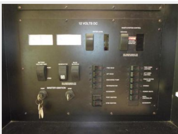
Sea Ray 370 aft cabin AC