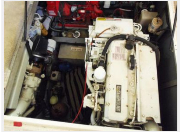
Sea Ray 370 aft cabin engine