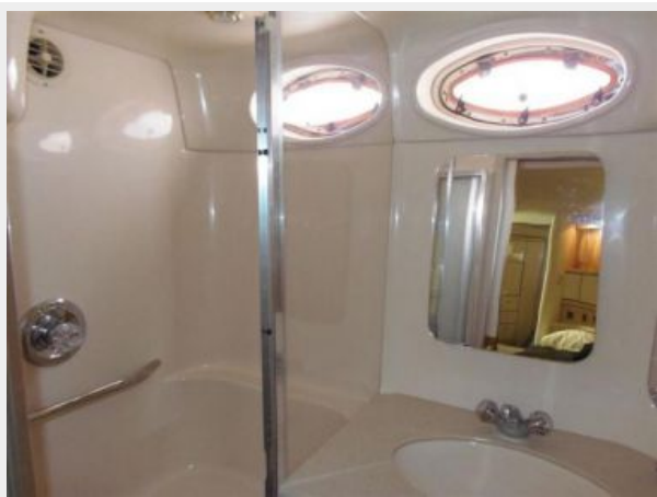
Sea Ray 370 aft cabin