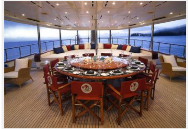
Aft Main Deck Dining