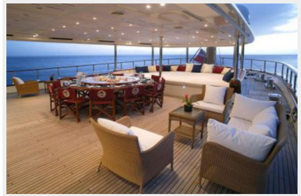
Aft Main Deck