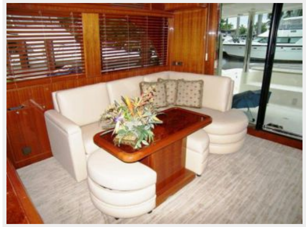
Salon View Looking Aft