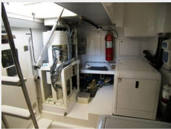
Lazarette A/C System