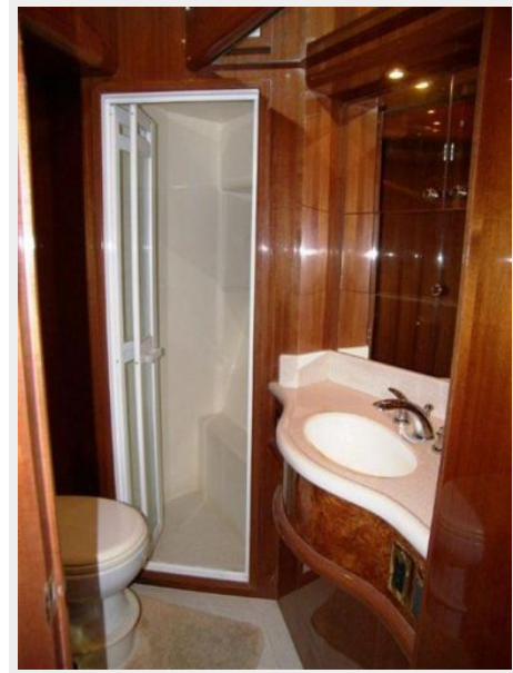
Shared Guest Head