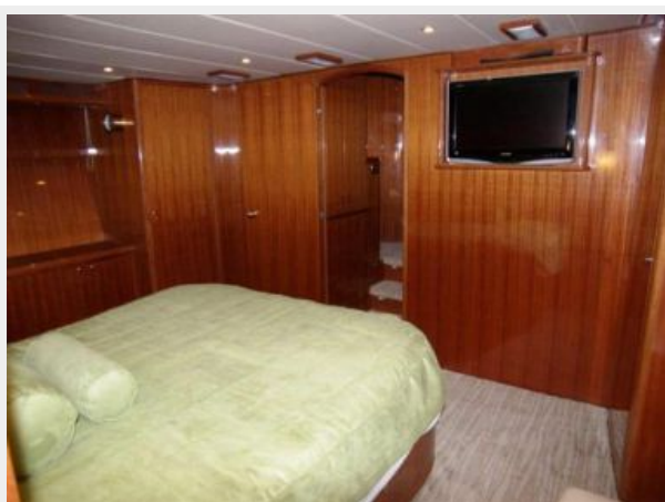
Master Stateroom TV