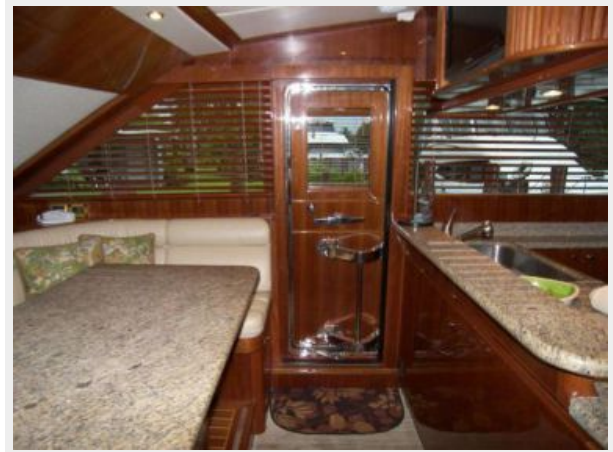
Stbd Side Aircraft Style