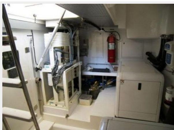
Lazarette A/C System