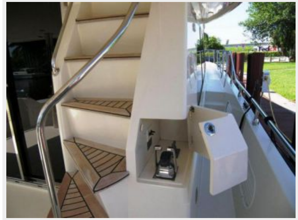
Stbd Docking Station