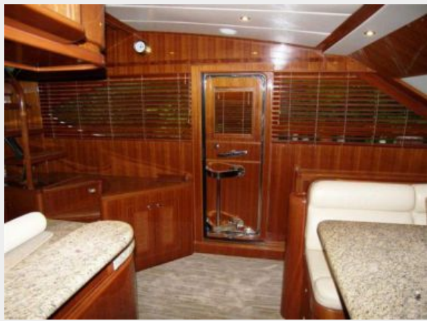
Port Side Aircraft Style Door