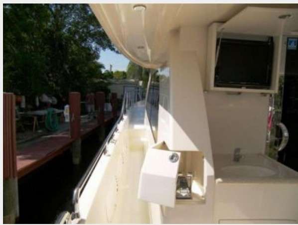
Port Docking Station