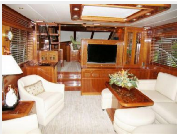
Salon View Looking Forward