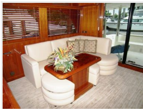
Salon View Looking Aft