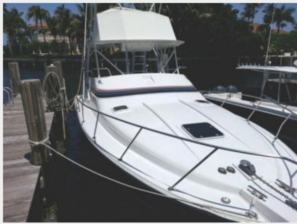
34' Luhrs starboard forward profile