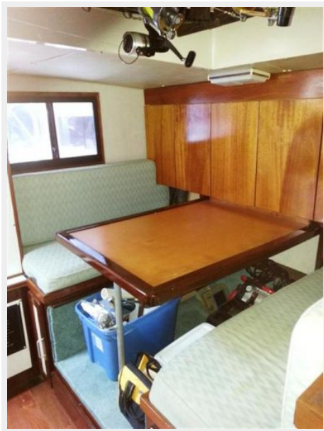
34' Luhrs dinette