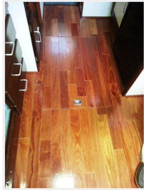
34' Luhrs salon sole