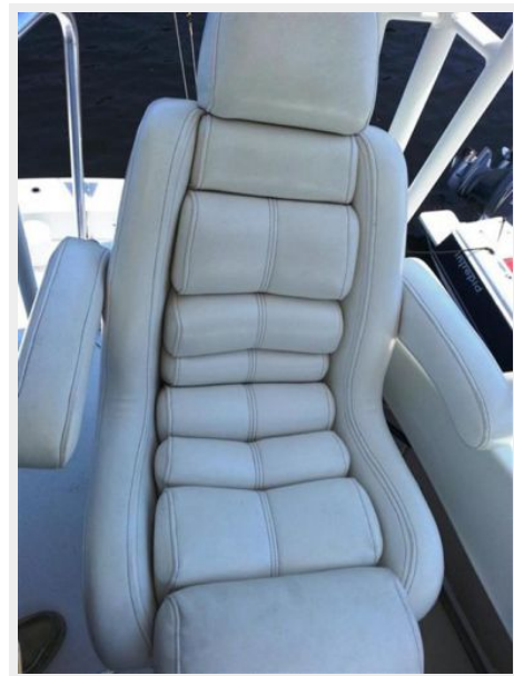
34' Luhrs flybridge helm seat