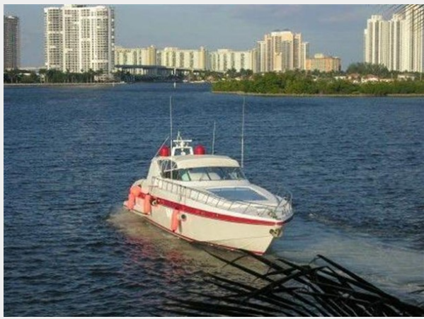
Running Shot 2