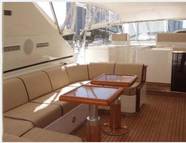
Aft Deck 2