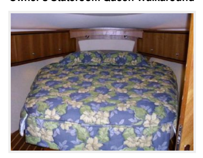
Owner's Stateroom Queen Walkaround