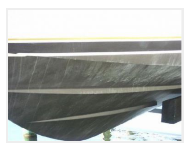
Clean, Clean, Clean