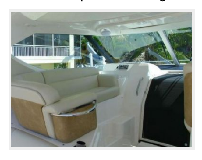
Helm Companion "L" Lounge