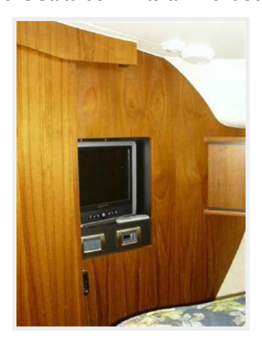
Owner's Stateroom Entertainment Center