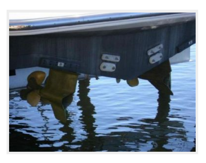
Clean Zincs Little Wear