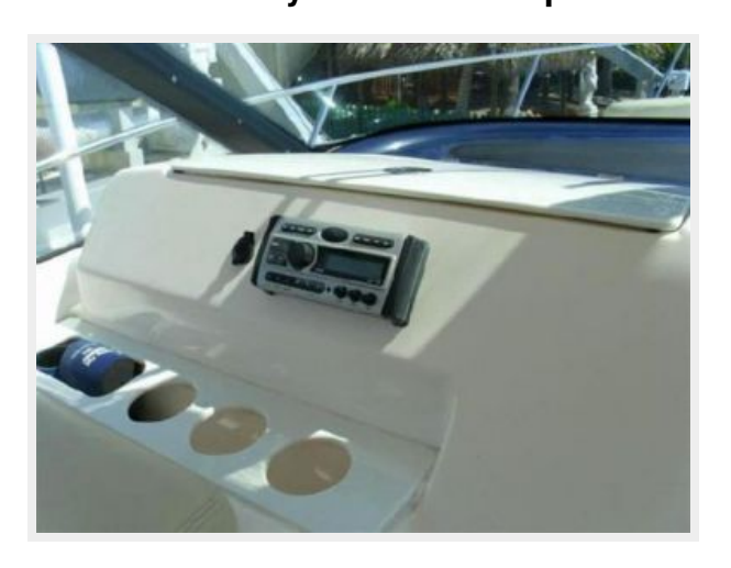
Sound System for Cockpit