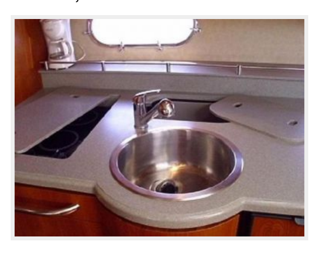
Stove, Sink and Refuse Container