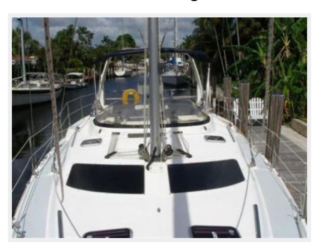
Cockpit Folding Table