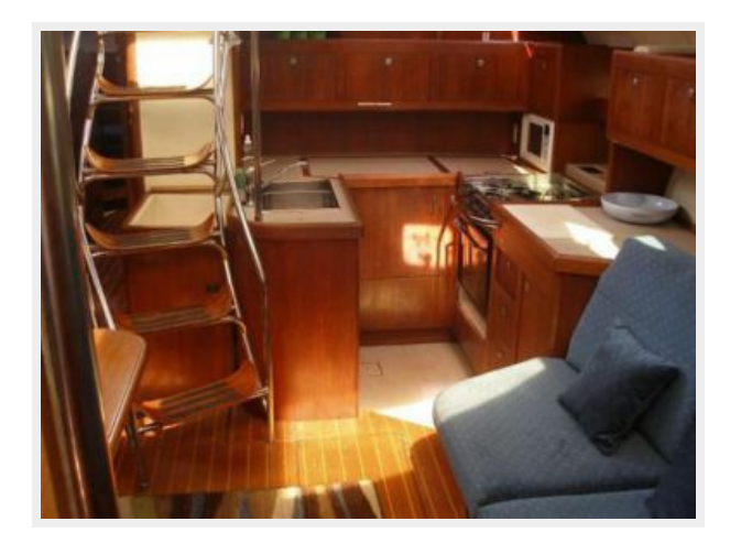
Main Salon Aft Port Side