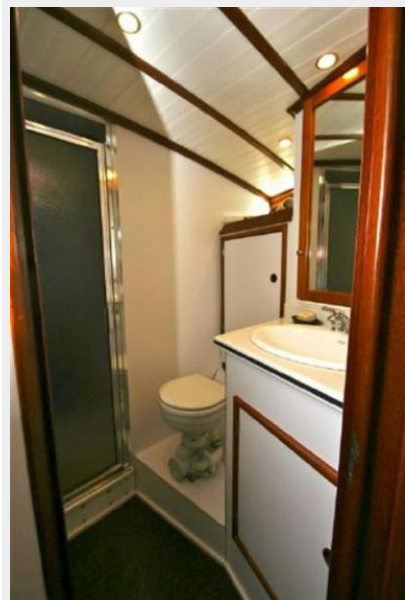
FORWARD HEAD LOOKING AFT