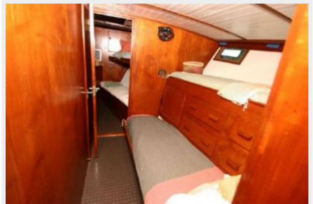
MID GUEST STATEROOM TO FORWARD