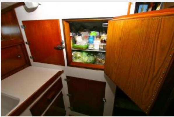
GALLEY REFRIGERATION BOXES