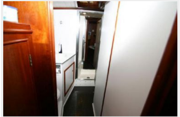
FORWARD INTO HEADS FROM MASTER