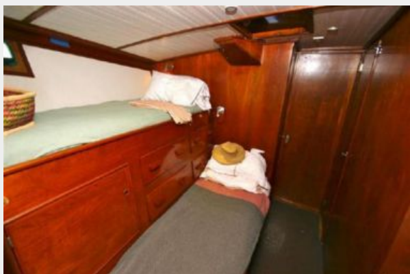
MID GUEST STATEROOM TO AFT