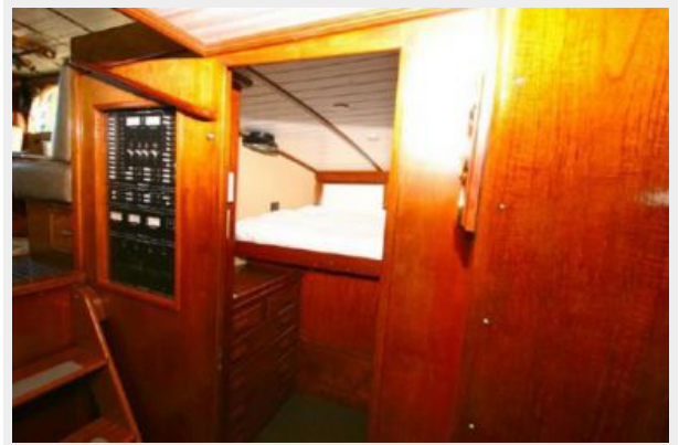
ENTRY DOOR INTO MASTER STATEROOM