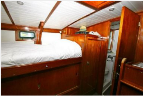
MASTER STATEROOM FORWARD