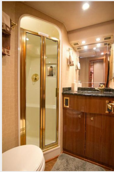
Starboard Guest Head