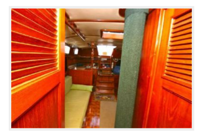
SALON FROM VBERTH