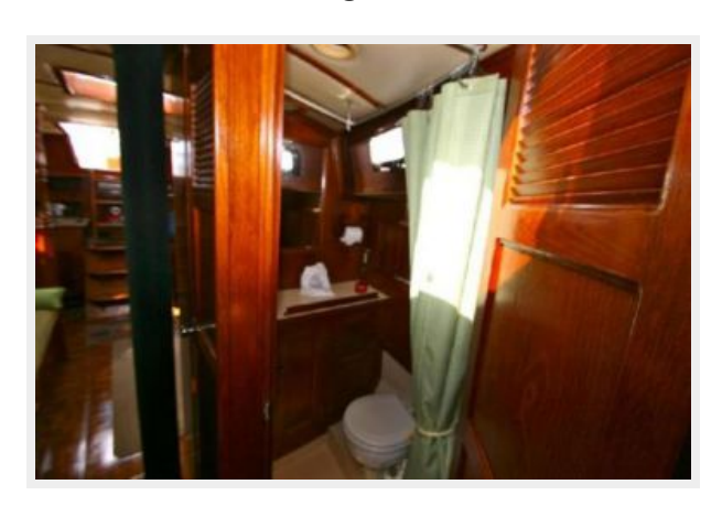
HEAD FROM VBERTH