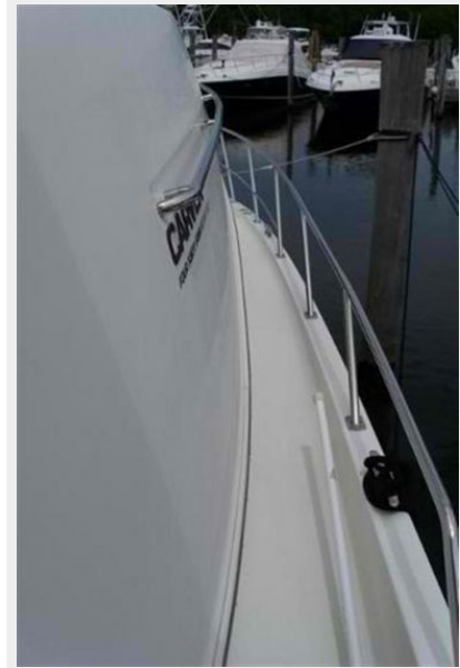
Wide Starboard Walkway to Bow