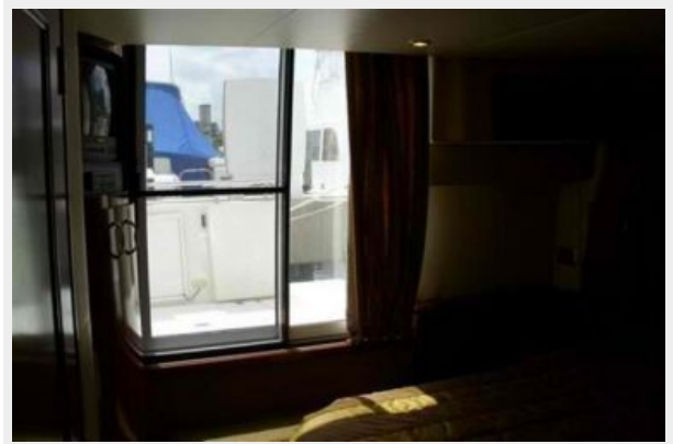
Owner's Suite Ocean View Door