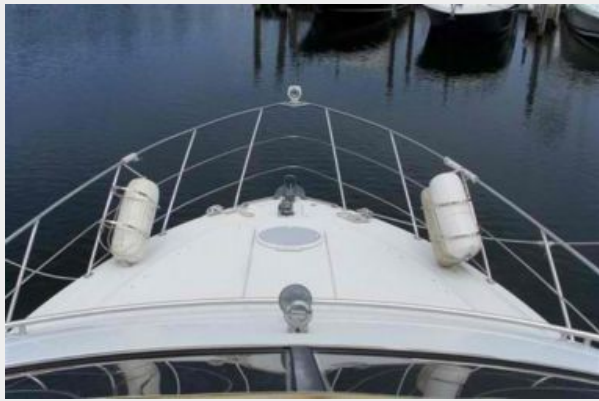
Clear View of the Bow