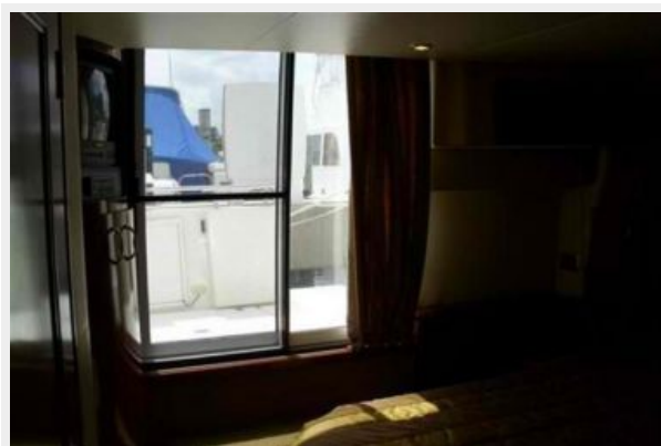
Owner's Suite Ocean View Door