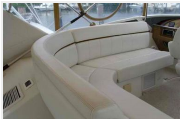
Command Bridge Lounge