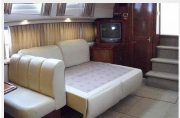
Salon Sofa Starboard convertible