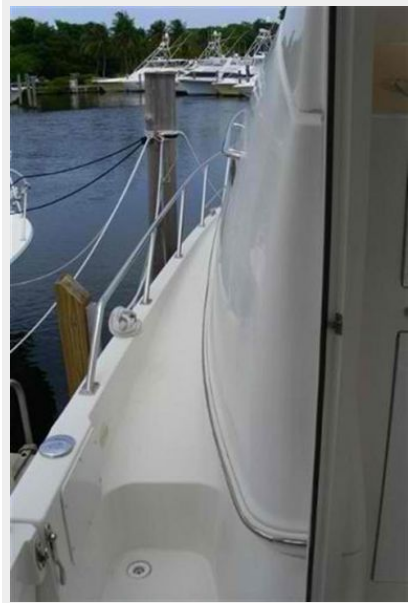
Wide Port Walkway to Bow