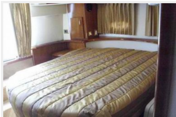
Owners Suite Queen Berth