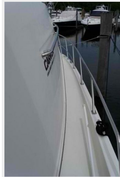
Wide Starboard Walkway to Bow