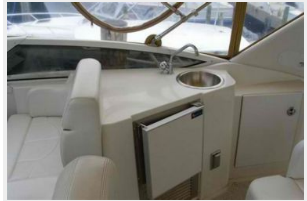
Wet Bar on Command Bridge