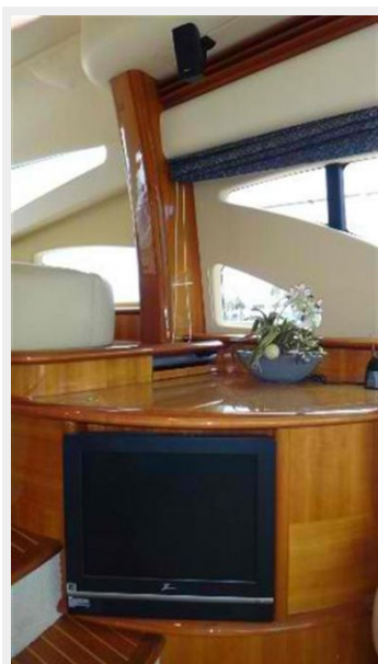
Main Salon LCD Bose System