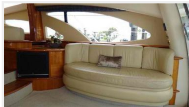
Main Salon Starboard