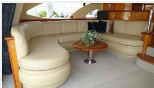
Main Salon Port