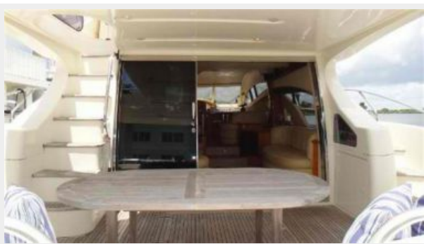
Aft Deck Forward